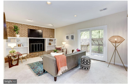
Family room with fireplace