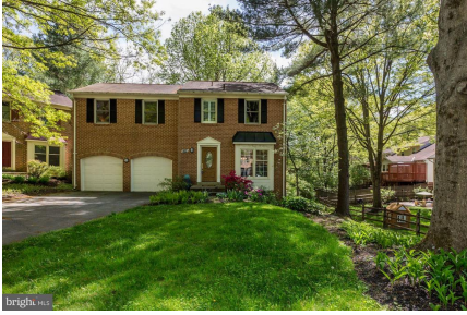
Welcome to 2506 Campbell Place!