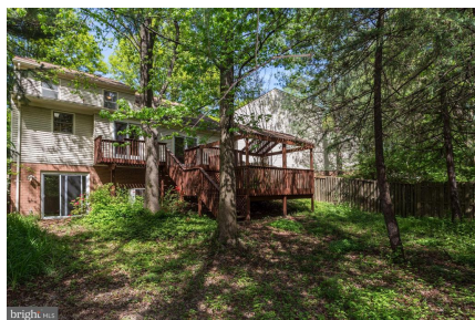
Beautiful backyard with access to basement