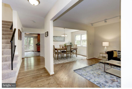
Open concept main level