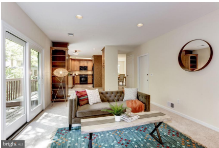
Living area opens to beautiful outdoor space