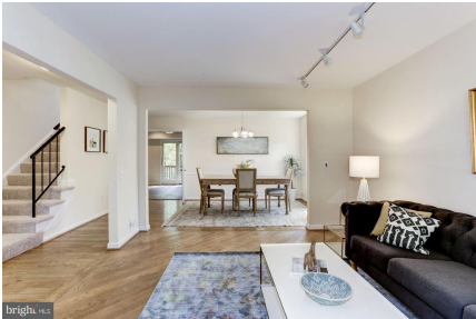
Light-filled space for entertaining