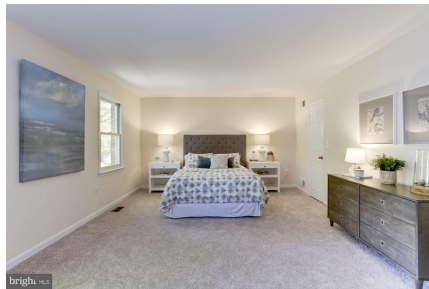
Owners' Suite bedroom