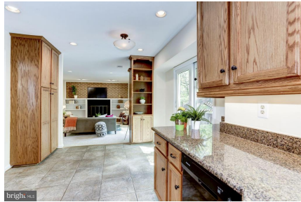
Kitchen flows in dining/living space