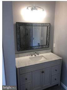
Matching his/her master vanities