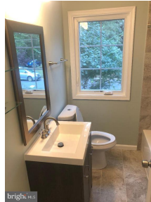
Main floor full bathroom