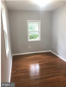
Main floor office/bedroom