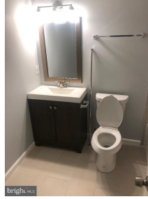
Basement full bath