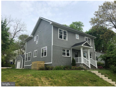
Brick and cement siding w/second floor addition Gourmet kitchen with Quartz counters SS appliances