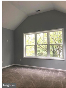
Master bedroom with cathedral ceiling