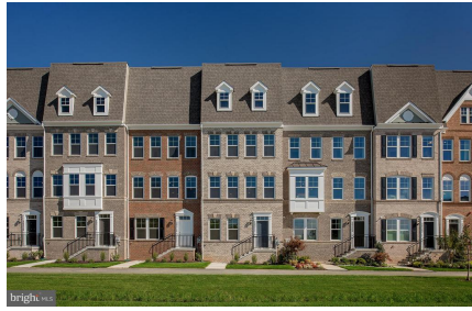
Illustrative purposes only.