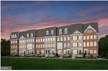
Illustrative purposes only.