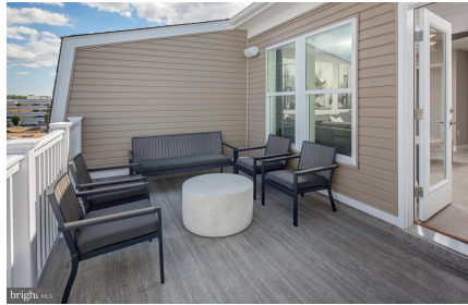
Illustrative purposes only.