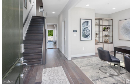
Illustrative purposes only.