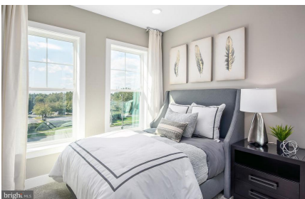
Illustrative purposes only.