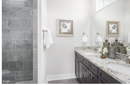
Illustrative purposes only.