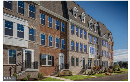
Illustrative purposes only.