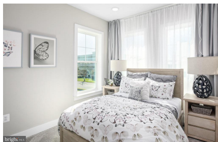
Illustrative purposes only.