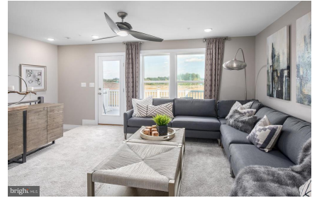
Illustrative purposes only.