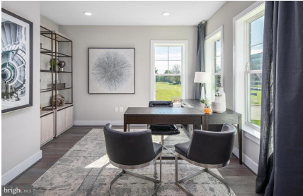
Illustrative purposes only.