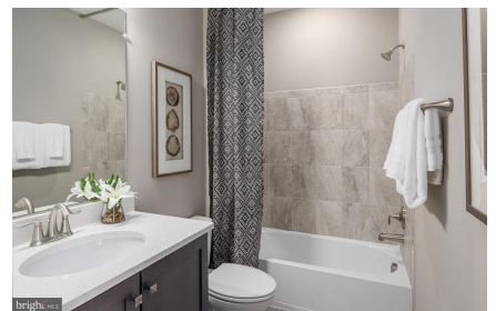
Illustrative purposes only.