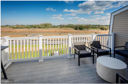
Illustrative purposes only.