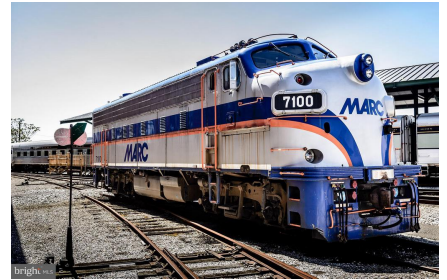
Community - Illustrative purposes