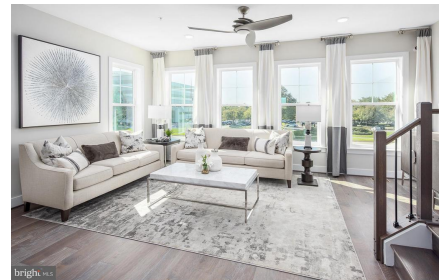
Illustrative purposes only.