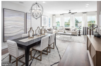
Illustrative purposes only.