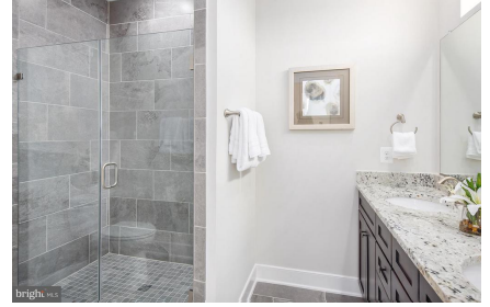
Illustrative purposes only.