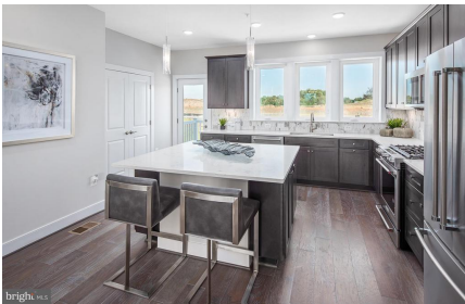
Illustrative purposes only.