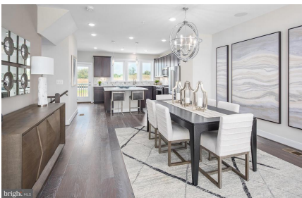
Illustrative purposes only.