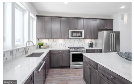
Illustrative purposes only.