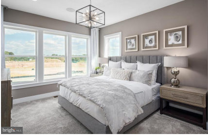
Illustrative purposes only.