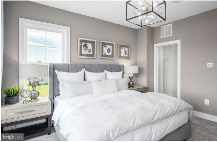
Illustrative purposes only.