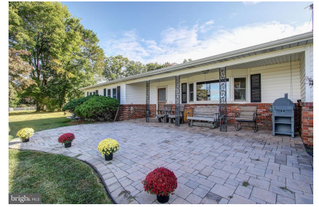
Exterior Front with newer paver front patio