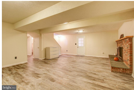
Basement Rec Room