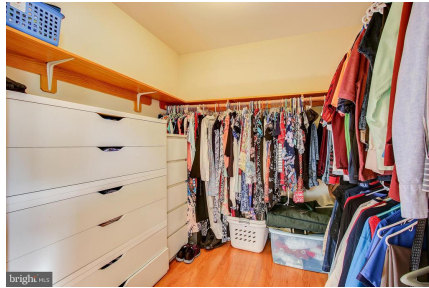
Master Bedroom with Walk-in Closet