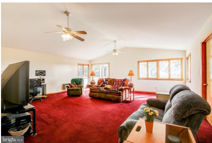
Huge Back Sunroom/Family Room