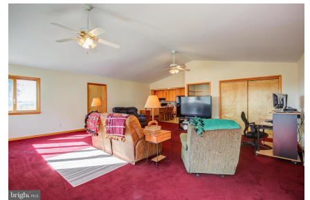
Huge Back Sunroom/Family Room