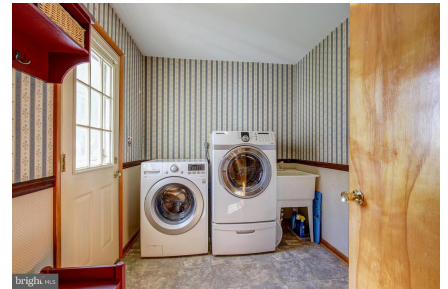
Washer and Dryer Area