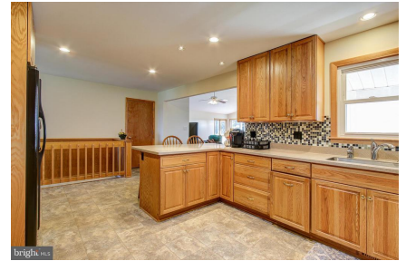
Large remodeled kitchen