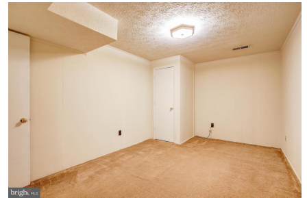
Den/office in Basement