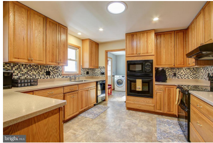
Large remodeled kitchen