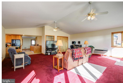
Huge Back Sunroom/Family Room