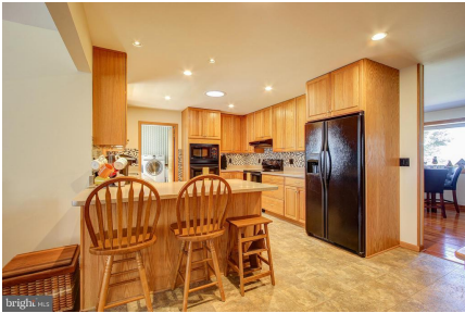
Large remodeled kitchen