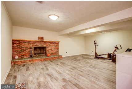
Basement Rec Room