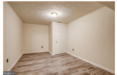
Sitting Room of Bedroom in Basement