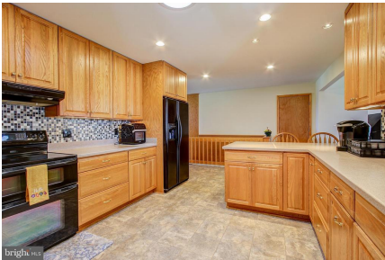
Large remodeled kitchen