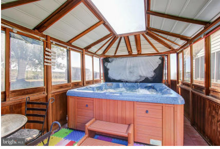
Hot Tub in Rear of Home