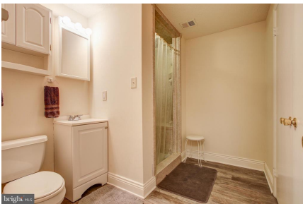
Newer Bathroom in Basement