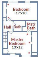
brighthomes, Inc. © TruPlace, Inc.