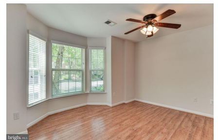
Master Bedroom with bay window!