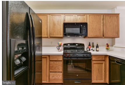
Kitchen- New appliances!