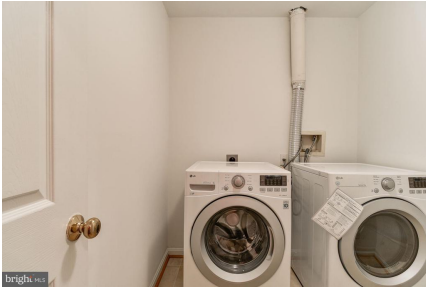
New Front Loaders in sep laundry room