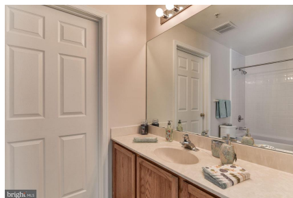
Full Bath with New Bathfitter tub!