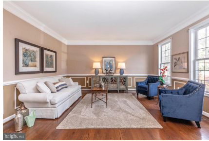
Open Floor Plan with Formal Livingroom