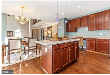
Eat in Kitchen