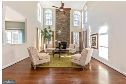
Palatial Windows dominate gorgeous livingroom