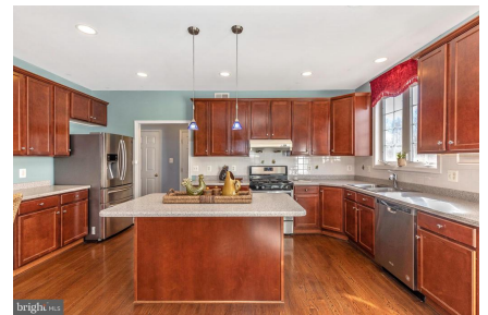
Kitchen with stainless appliances and gas stove