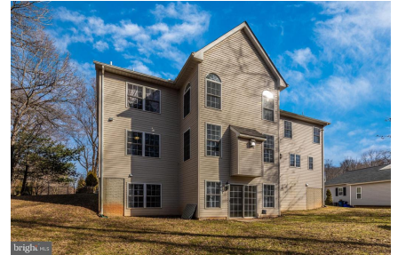
Backyard backs to trees