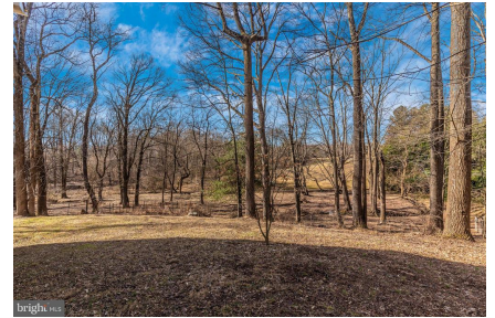
Treed lot backs to stream