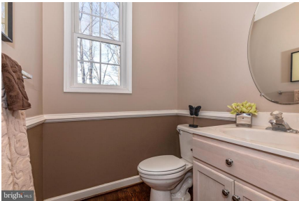
First floor half bath