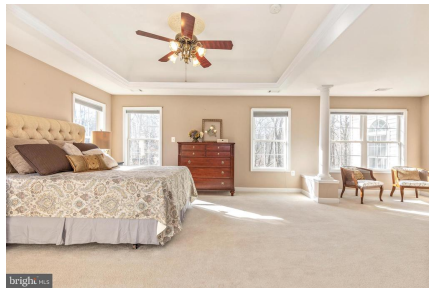
Spacious sitting room off Master Bedroom