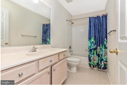
Full Bathroom on second level