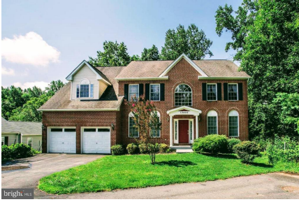
Beautiful Brick Front Colonial on .58 acres!