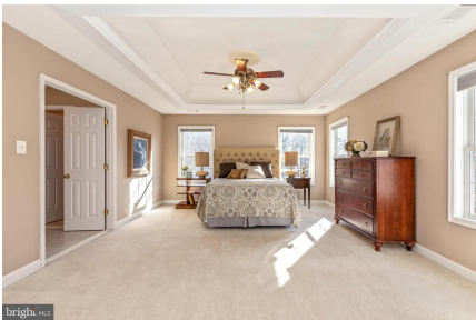
Elegant Master Bedroom