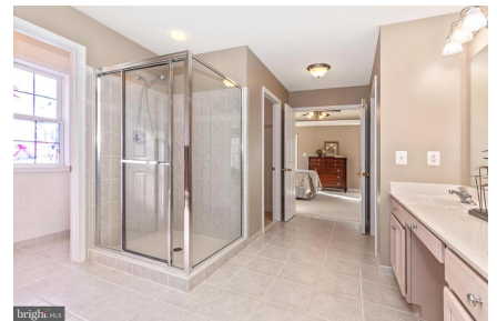
Master Bath with double vanity