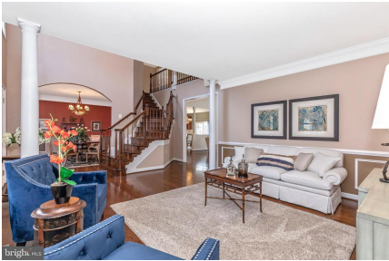
Formal Livingroom leads to Dining Room