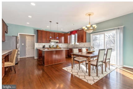
Kitchen with stainless appliances and gas stove