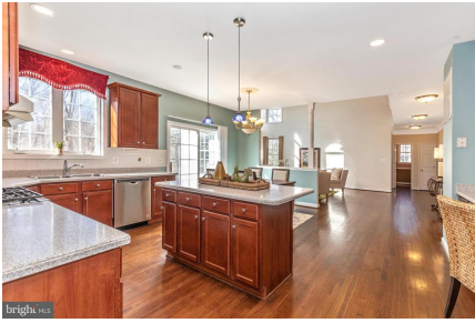
Kitchen open to Living Room