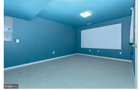
Gaming room on Lower Level