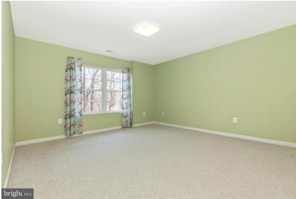
Bedroom Five on Lower Level