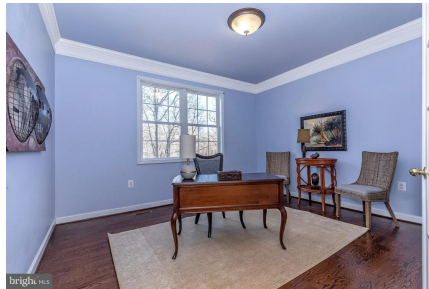
Office can double as First Floor Bedroom!