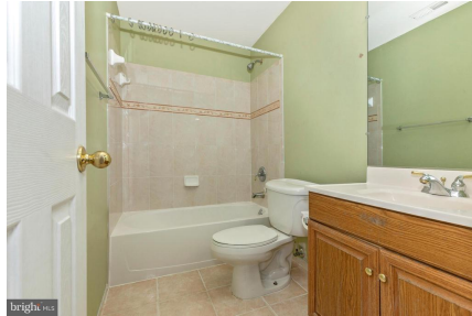
Full Bath on lower Level