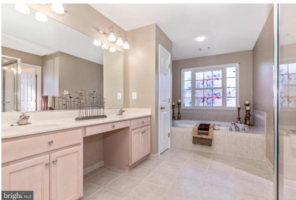
Master Bath with separate WC