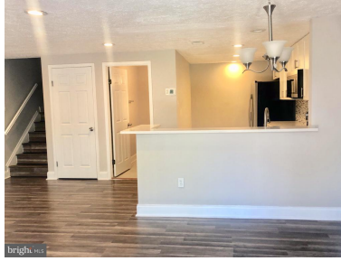
VIEW FROM ENTRANCE