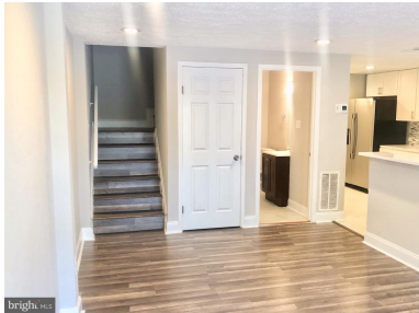
VIEW FROM FAMILY/LIVING ROOM