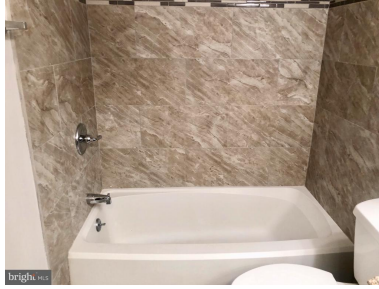
NEW SHOWER AND BATHTUB SPACIOUS MASTER BEDROOM SUITE ON THE 3RD LEVEL