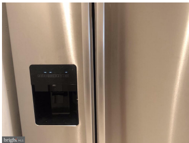
NEW STAINLESS STEEL DOUBLE DOOR REFRIGERATOR