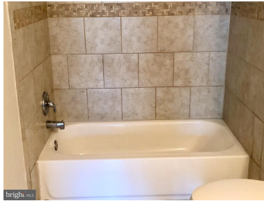
NEW SHOWER AND BATHTUB