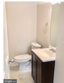
NEW HALF BATH