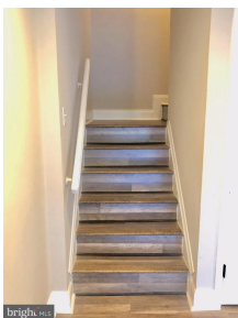
VIEW TO UPPER LEVELS