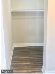
MASTER WALK-IN CLOSET