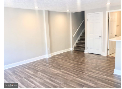
VIEW FROM ENTRANCE