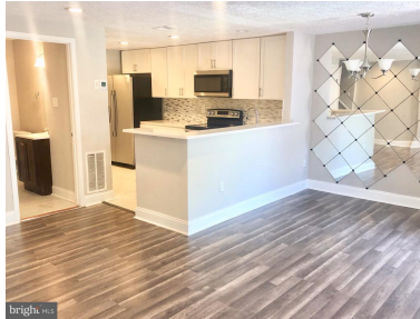
VIEW FROM LIVING/ FAMILY ROOM