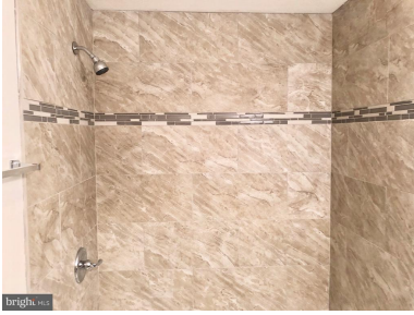
NEW SHOWER AND BATHTUB