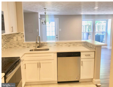
VIEW FROM INSIDE KITCHEN