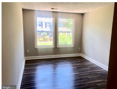
1 OF 2 BEDROOMS ON THE 2ND LEVEL