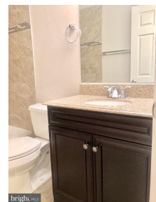
NEW 2ND LEVEL FULL BATHROOM