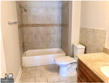
NEW MASTER BATHROOM