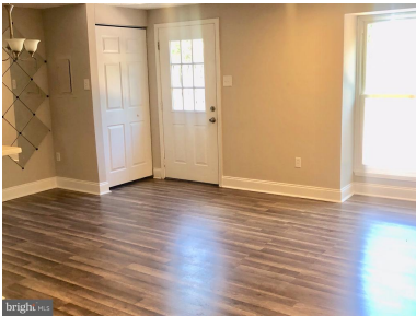
VIEW COMING DOWN FROM UPPER LEVELS