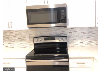
NEW STAINLESS STEEL STOVE AND MICROWAVE