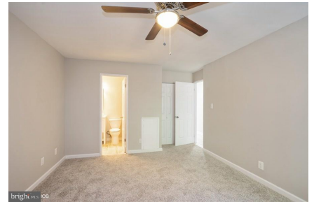
Bedroom 2 other view