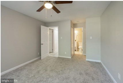
Bedroom 1 closet