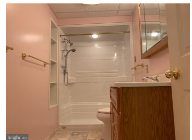
Full Bathroom Basement