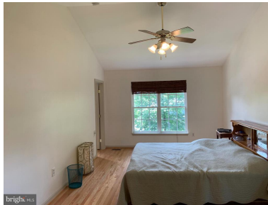
Master Bedroom with Vaulted Ceiling