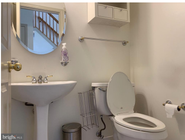
First floor half bath