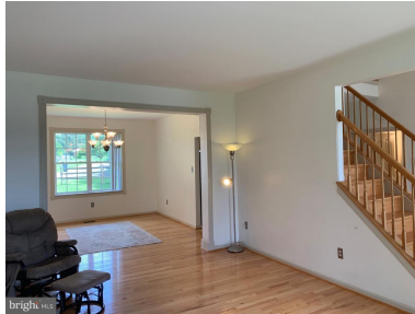
Living room with fireplace