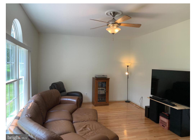
Living Room #2