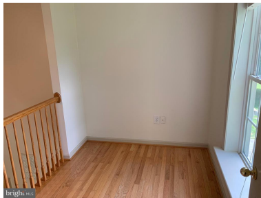
Bonus Room off Master