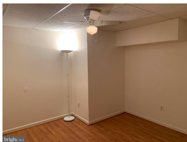
Basement bonus room