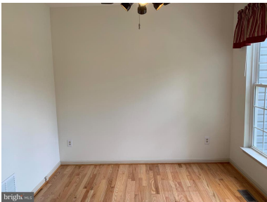
First floor office