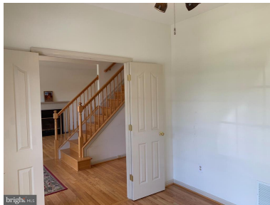
First floor office