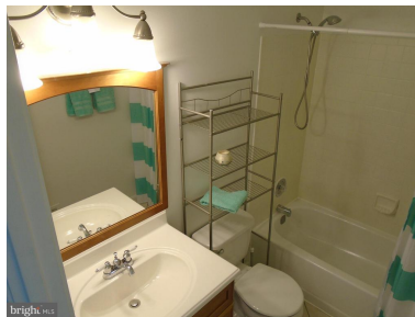
Full Bath Upstairs Off Of Hall