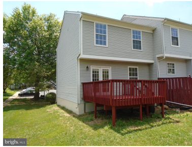
Rear Of Townhome