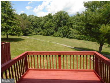
Awesome View Overlooking Green Open Space