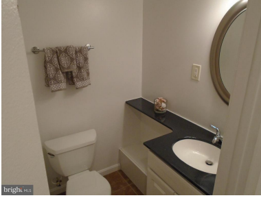
View Of Full Bath In Finished Basement