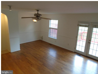
Combination Living and Dining Room