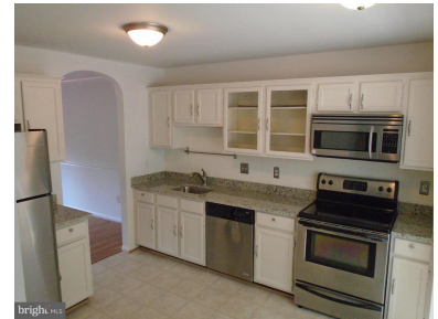
Well Appointed Kitchen