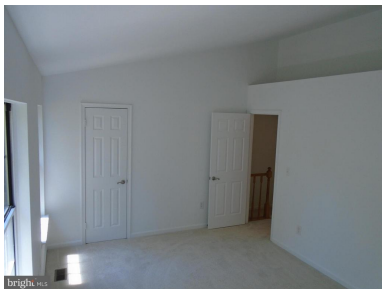
Master Bedroom View Of Vaulted Ceiling