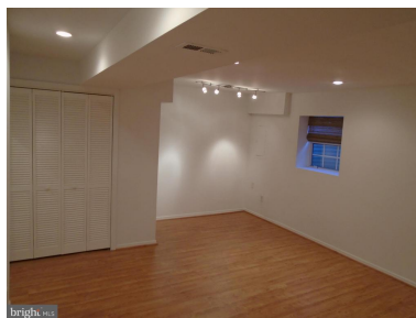
Finished Basement With Track & Recessed Lighting