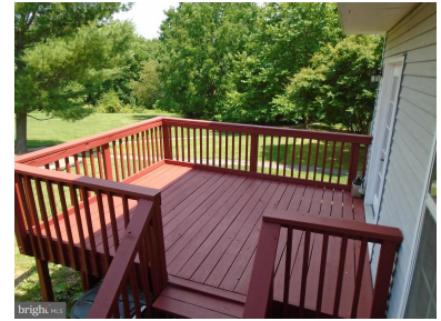
Large Deck Ready For Summer