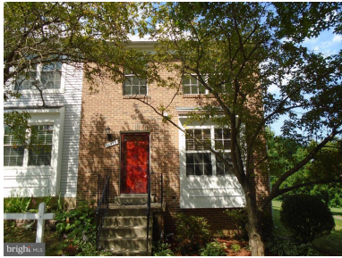
Brick Front Preferred End Unit