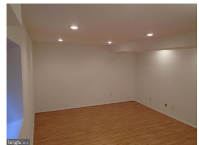
Additional View Of Finished Basement