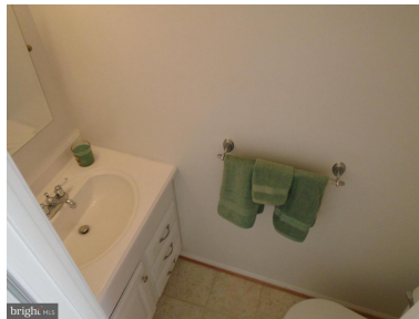
Half Bath On Main Level