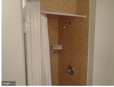
Tile Stand-Up Shower In Finished Basement