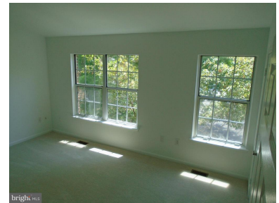
Sunny Master Bedroom