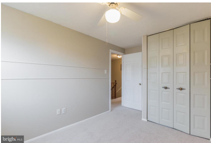
Bedroom # 2