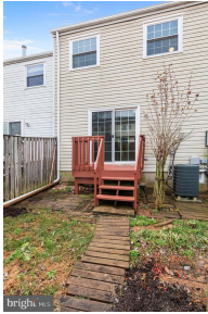
Deck and private fenced backyard