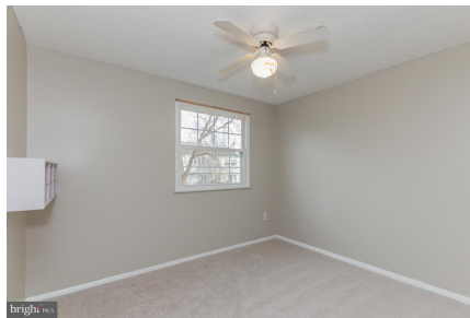
Bedroom # 3