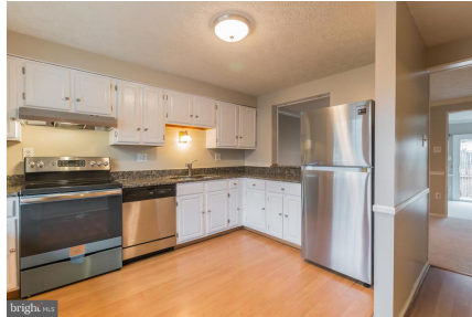
Kitchen with all new stainless steel appliance