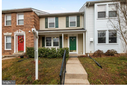
Middle unit townhome