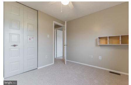
Bedroom # 3