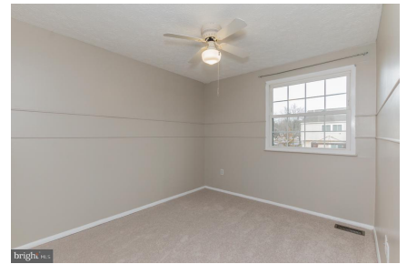
bedroom # 2