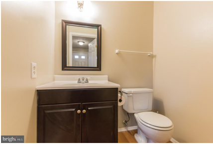
Main level powder room