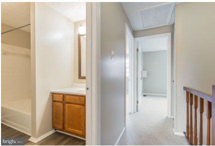
Hallway full bath