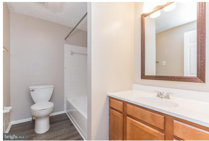
Hallway full bath