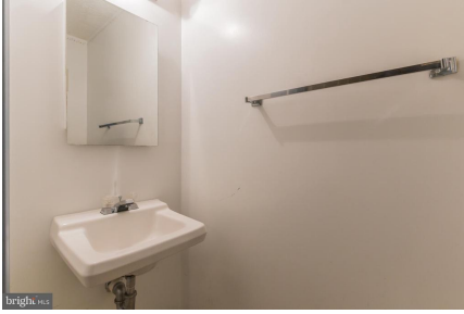
Basement half bath