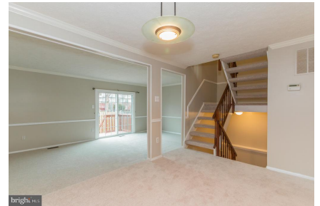
View of living/ dining from kitchen