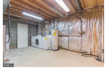
Basement utility and storage