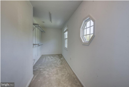
Oversized Walk In Master Closet