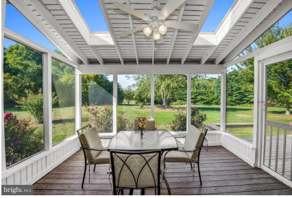
Screened In Porch Off Of Kitchen