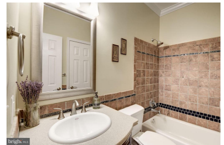
Main Floor Full Bath