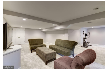
Lower Level Rec Room