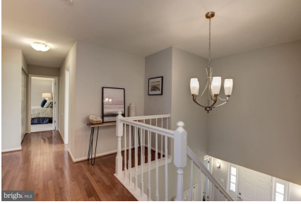
Upper Level Hallway