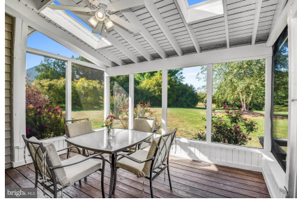
Screened In Porch Off Of Kitchen