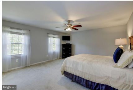
Upper Level Bedroom