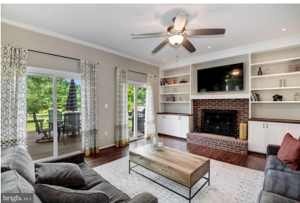
Family Room With Custom Built-Ins