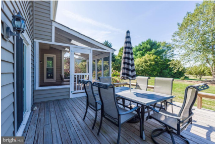
Custom Deck With Bench Seating