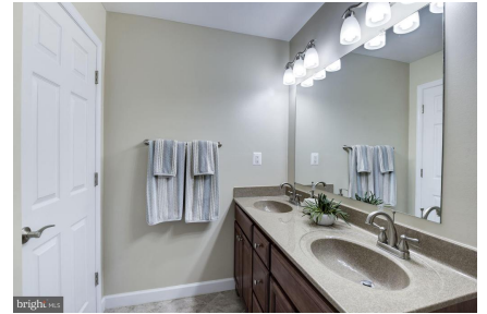
Upper Level Full Bath