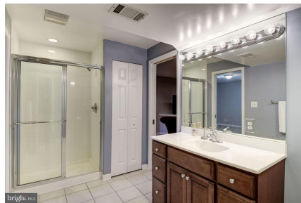
Lower Level Full Bath