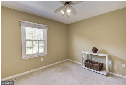
Upper Level Bedroom