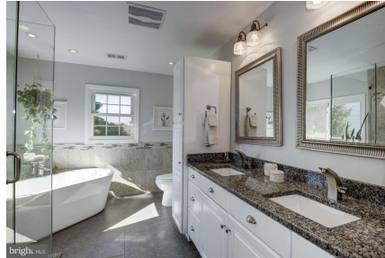
Master Bath Flooded With Natural Light