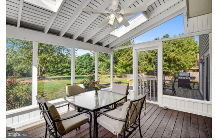
Screened In Porch Off Of Kitchen