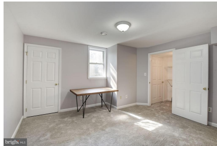
Lower Level Bedroom