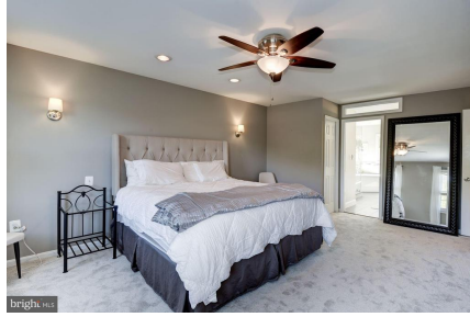
Spacious Master Bedroom