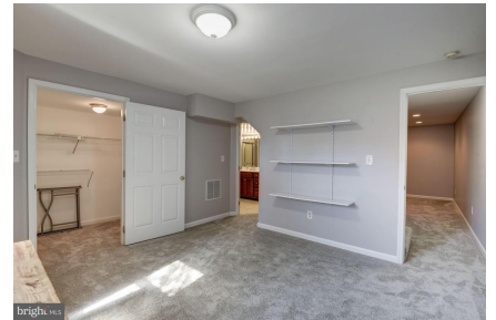
Lower Level Bedroom