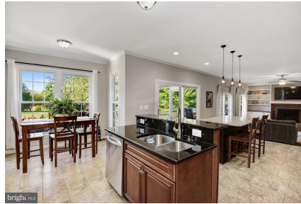
Open Concept Kitchen & Family Room