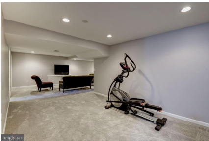
Lower Level Rec Room