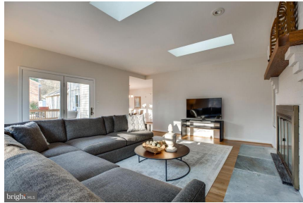
Sectional sofa for viewing TV