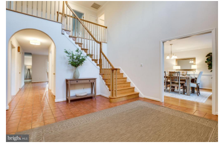
Foyer with view to hall and dining room