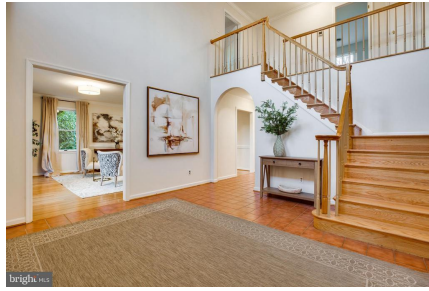
Two story foyer open to living room