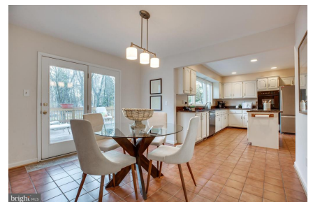
View of breakfast area toward kitchen