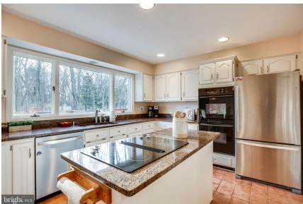
Kitchen with large window overlooking back yard