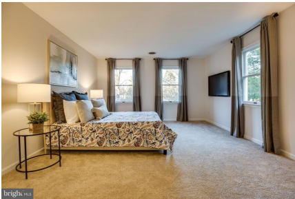
Master bedroom with large windows