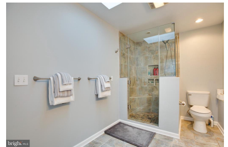
Master bath with separate shower