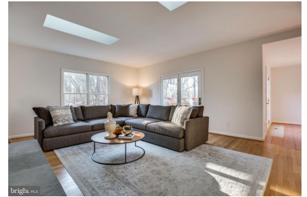
Family room view to outside deck