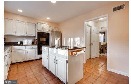
Kitchen view to dining room