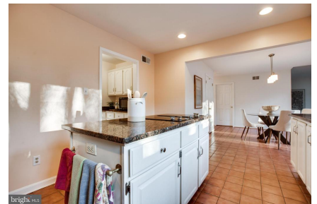
Kitchen view toward breakfast nook