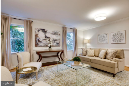
Living room from the foyer