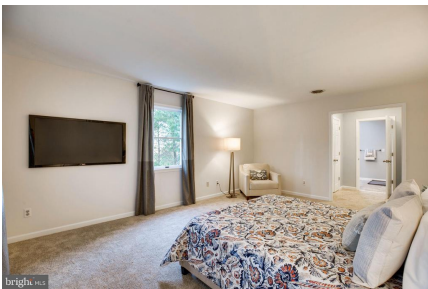
Master bedroom with space for large screen TV