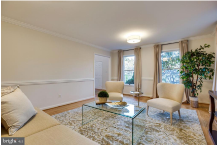
Living room conversation area