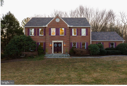
Front view with new gutters and downspouts.