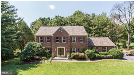
Custom colonial on 2 acres walk out level yard