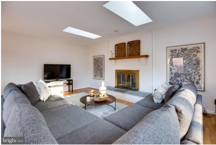
View of family room