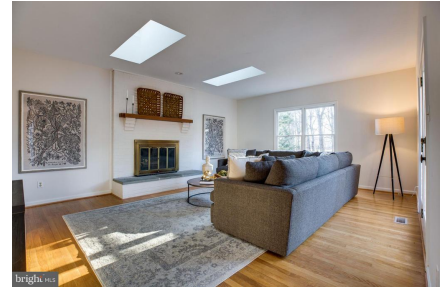
Family room with fireplace, french doors to deck