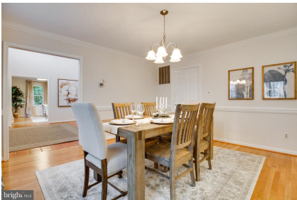
Dining room open to the foyer