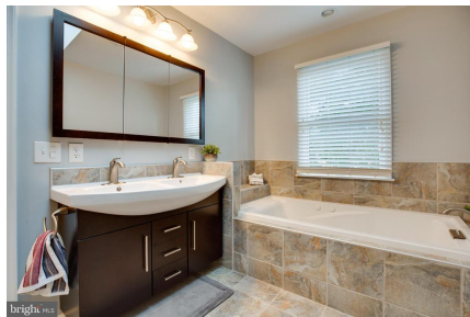
Master Bath Soaking tub with jets