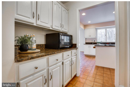
Butlers pantry for serving buffets