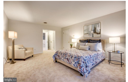
Master bedroom with seating area