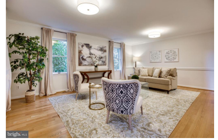
Living room new lighting fixtures