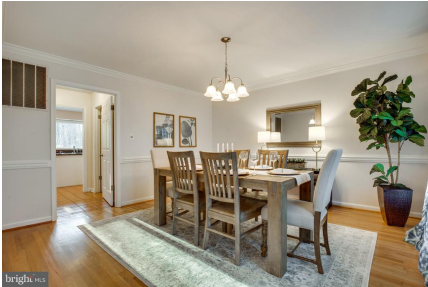
Dining room open to butlers pantry