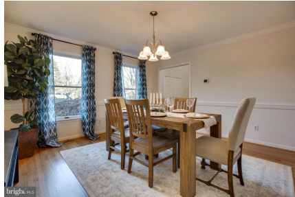
Dining room open to the foyer