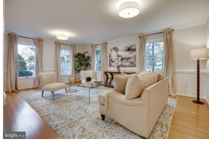
Light and bright living room 4 large windows