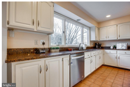
Kitchen view with stainless appliances