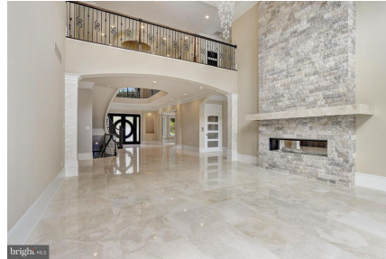
2 sty Great Room