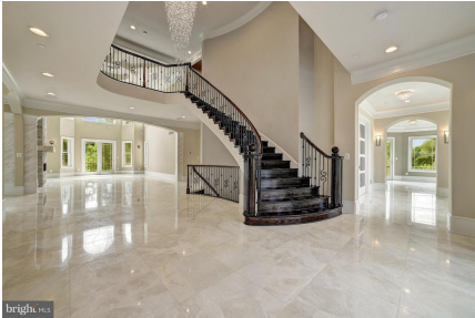
Foyer with marble Floors