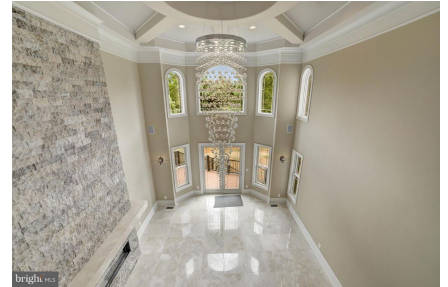
2sty Great Room