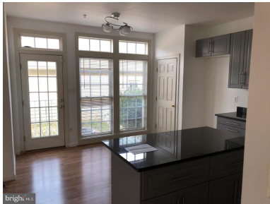
Kitchen View 3