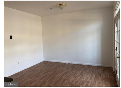
Kitchen View 2