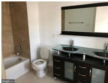
Full Bath 1