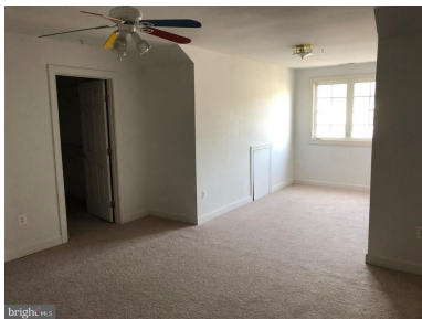
Bedroom 4 / Loft area