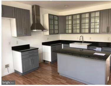
Kitchen View 1