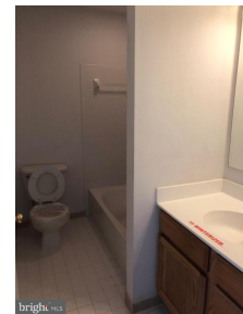
Full Bath 2