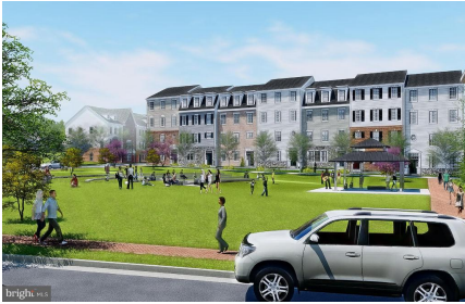
Future Clarksburg Town Center