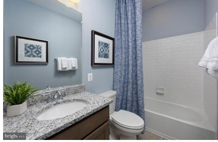
Spacious Hall Bath