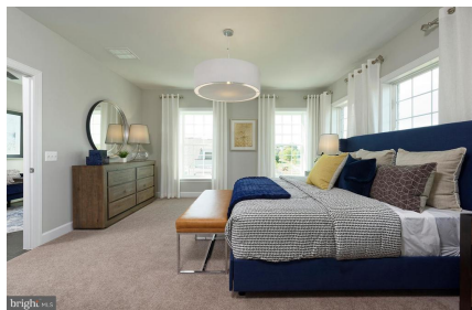
Sunlit and Serene Owner's Suite with Carpet