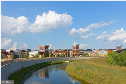
Clarksburg Premium Outlets