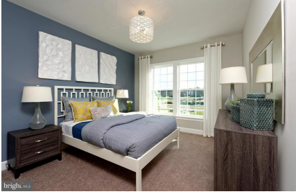
Spacious Secondary Bedroom