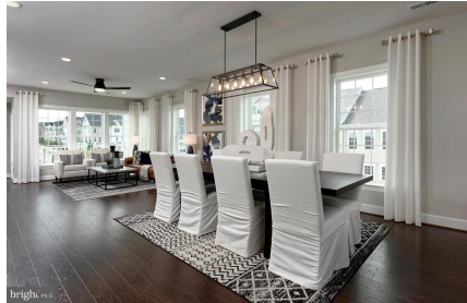
Dining Space Open to Kitchen, Living & Family Room