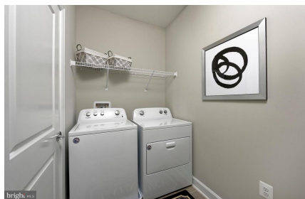
Laundry Room on Bedroom Level