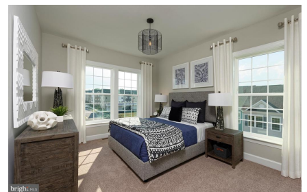
Spacious Secondary Bedroom