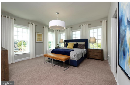
Sunlit and Serene Owner's Suite with Carpet