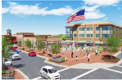
Future Clarksburg Town Center