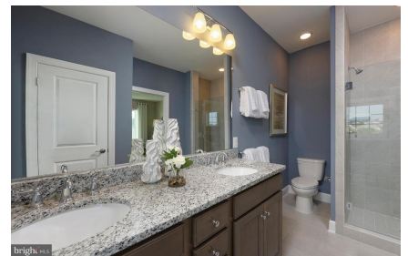
Owner's Bath with Double Bowl Sink