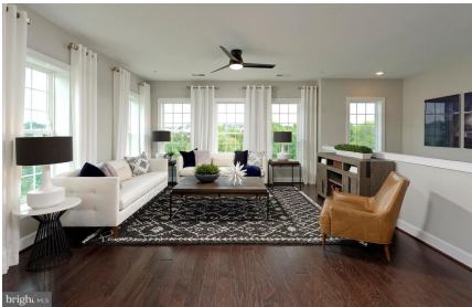
Bright and Spacious Living Room