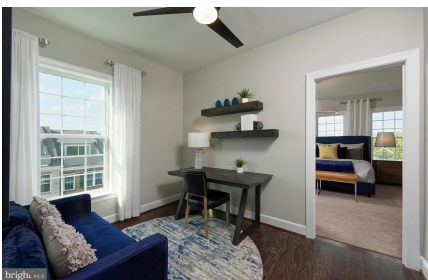
Second Floor Home Office