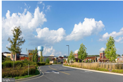
Clarksburg Premium Outlets