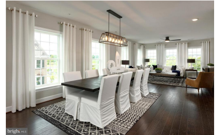
Dining Space Open to Kitchen, Living & Family Room