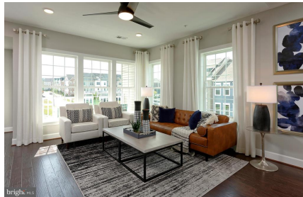
Bright and Spacious Living Room