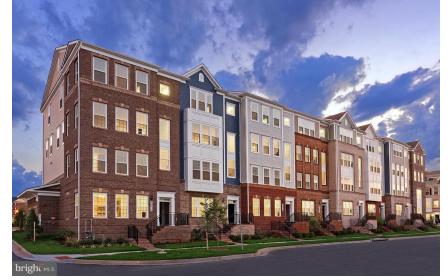
Luxury Condos with 3 BR and 1-Car-Garage