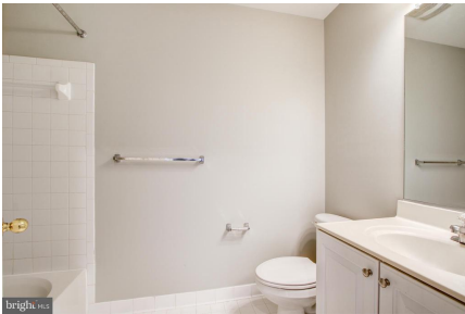
Hall Bath - Upper Level