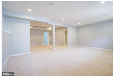
Basement - Rec Room