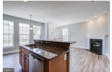
Family Room - view from Kitchen