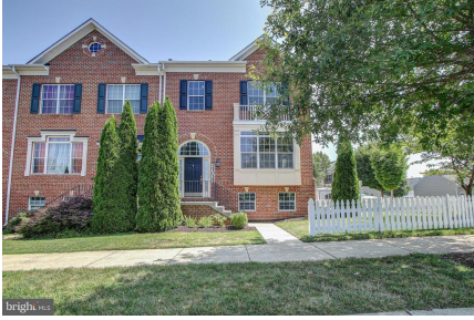
Front - View 1