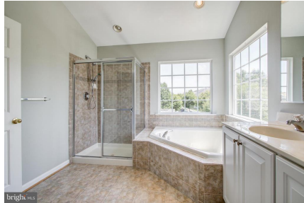
Master Bath - View 2