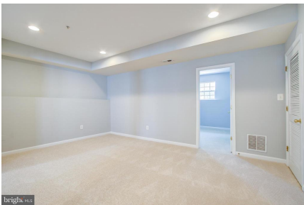
Basement Rec Room & Door to Bedroom