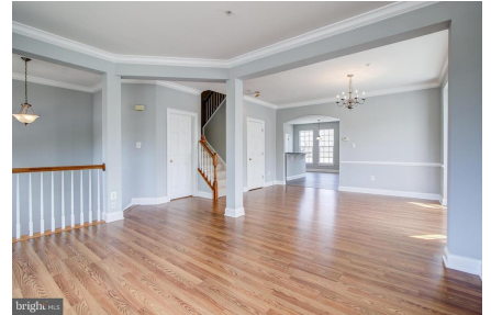
Living & Dining