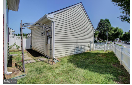
Garage Entrance from Patio