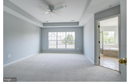
Master BR - View 2