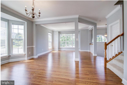
Living & Dining Rooms - View from Kitchen