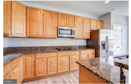
Kitchen - View 1