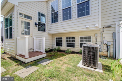
Patio and Breezeway