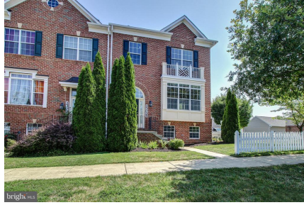
Front - View 2