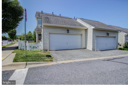
2 Car Garage