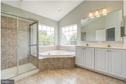
Master Bath - View 1