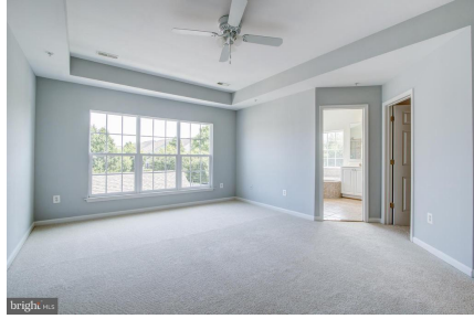
Master BR - View 1