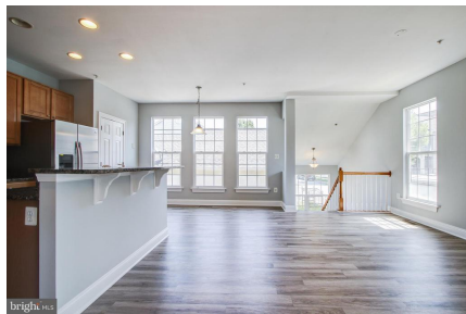
Kitchen & Family Room