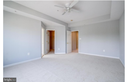
Master BR - View 3