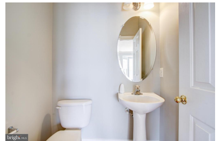
Powder Room - Main Level