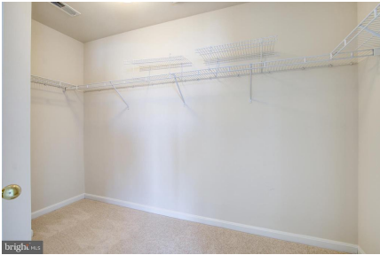
Master BR Walk In Closet