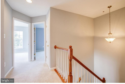
Stairs and hallway - Upper Level