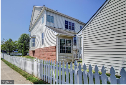
Side view of house and fence