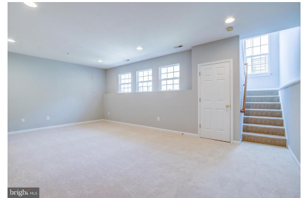
Basement - Rec Room and stairs to Kitchen