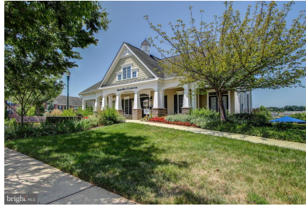
Club House and Pool