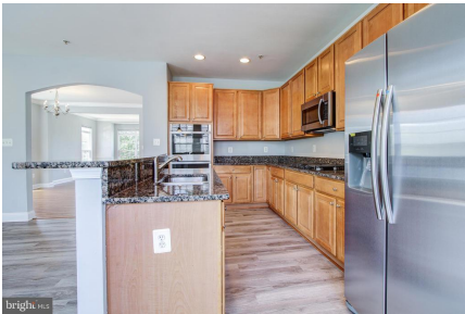
Kitchen - View 2