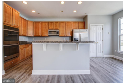
Kitchen - View 3