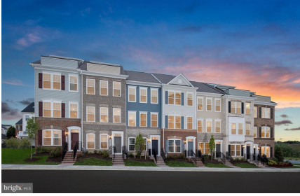
Luxury Townhomes featuring Rooftop Terrace