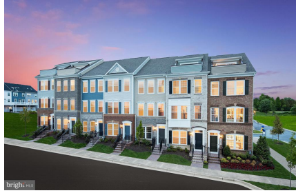
Luxury Townhomes featuring Rooftop Terrace