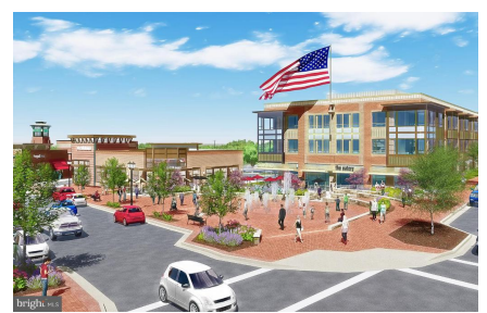
Future Clarksburg Town Center