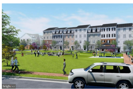
Future Clarksburg Town Center