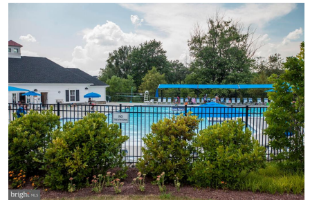
Clarksburg Village has multiple pools.