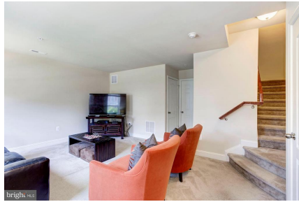
The lower level family or sitting room area.