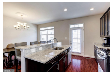
Walk out to your deck for those barbecues.