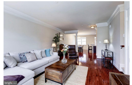
Another view that shows the expanse of this area.