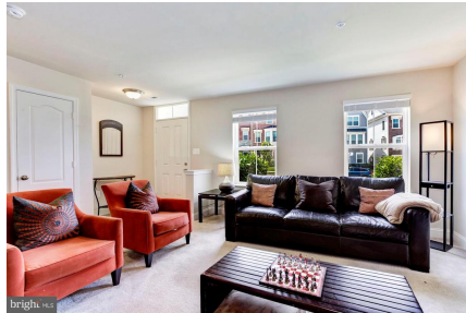
Lower level family or sitting room!