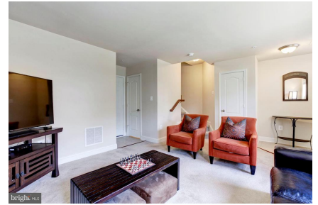
Half bath & access to garage from this level.