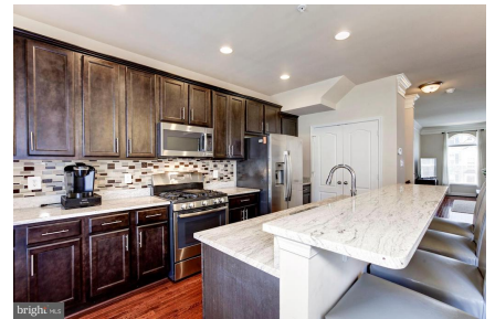
The island overhang is ready for dining pleasure.