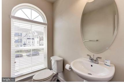
Half bath on Main level!