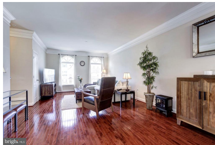
The beautiful hardwood floors in the living room!