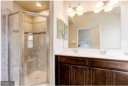
Well appointed tile accents!