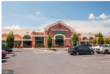
Harris Teeter...Take a walk, pick up a coffee.