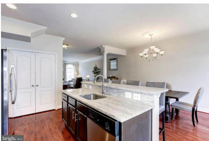
The cook is never isolated in this open floor plan