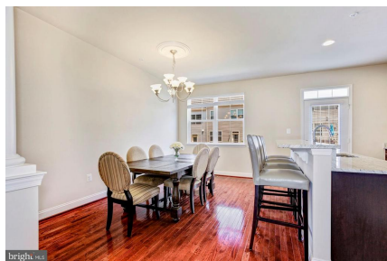
These floors continue to dazzle!