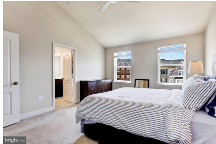
Master bedroom continued!