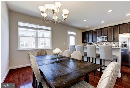
Great open floor plan for entertaining!