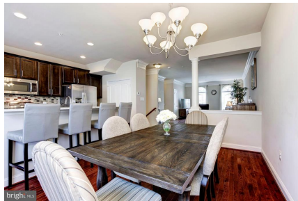
Spacious table space dining area.