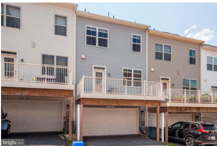
2 car garage and room on the parking pad for more.