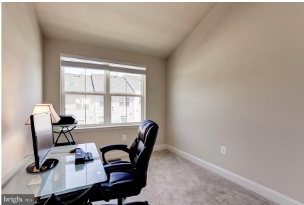
The third bedroom!