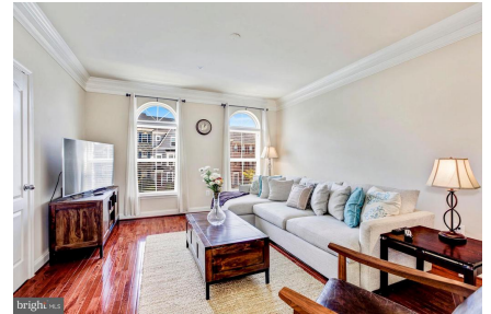
Don't miss that custom crown molding!