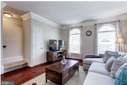
The dining area is brightly lit with natural sun.