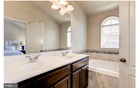
Soaking Tub in Master Bath!