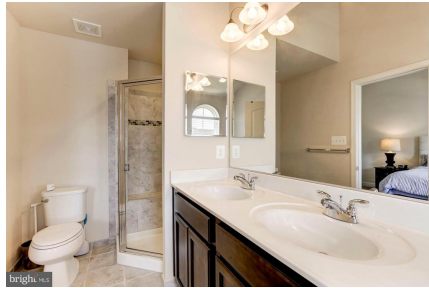
Dual sinks in Master Bath!