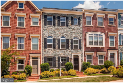
The front stone accent provides a WOW curb appeal