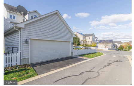
Rear loading garage