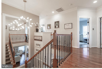
Upper Level Landing