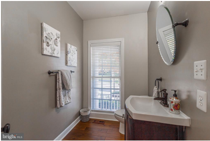
Main Level Powder Room