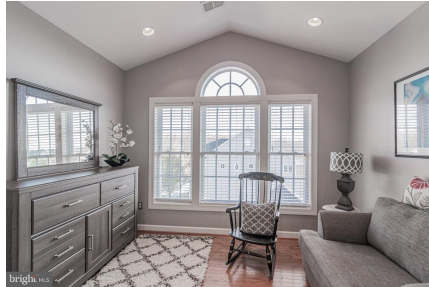
Master Bedroom Sitting Room