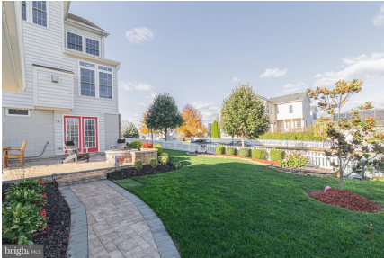
Walkway from Garage to house