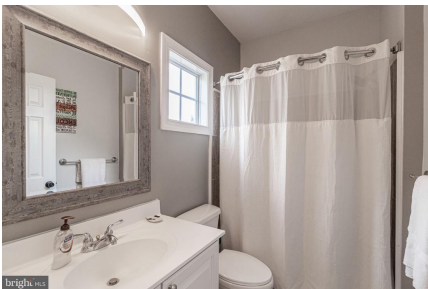
Upper Level Full Bath