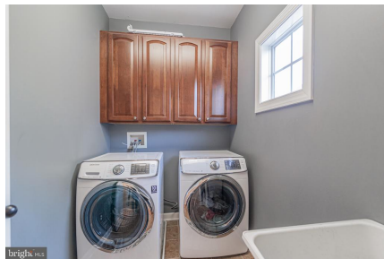
Upper Level Laundry Room