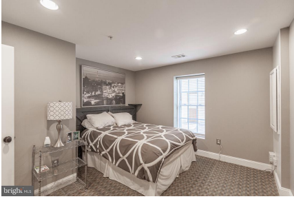
Lower Level Bedroom