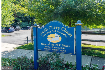
Close to the community pool