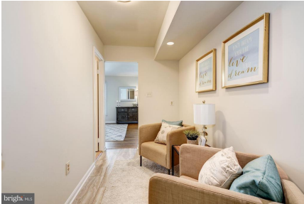
Master bedroom sitting room