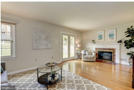
Family room with a wood-burning fireplace