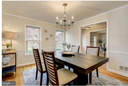
Wonderful entertaining space