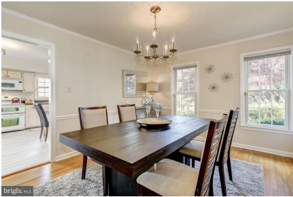
Bright and spacious formal dining room