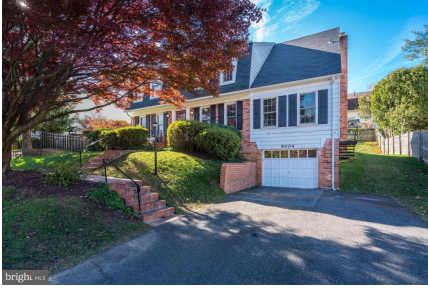
Charming, spacious Chevy Chase Colonial