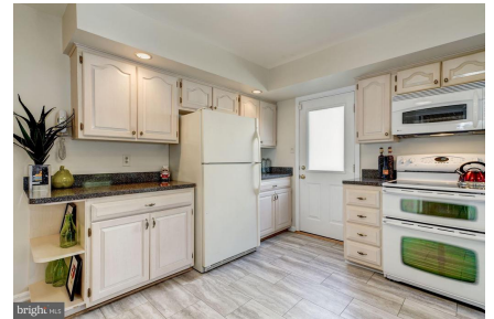
Another view of the kitchen