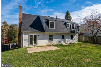
Rear view of the house