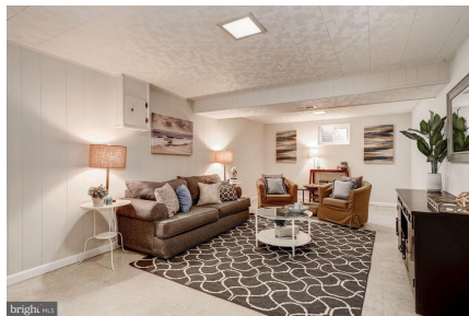
Finished lower level recreation room