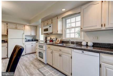
Another view of the spacious kitchen