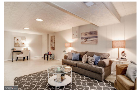
Another view of the recreation room