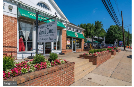
Starbucks, Einstein's and restaurant nearby