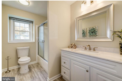
Hall bath with tub & shower & vanity