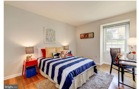
Bedroom with double door closet