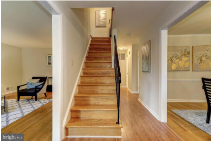
Stairway to the 2nd floor