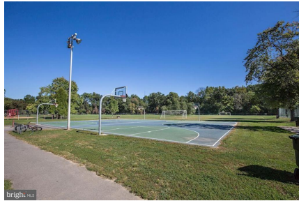
Park with basketball court