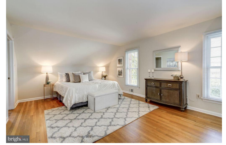
Private master bedroom with 2 double door closets