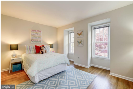
Bedroom with double door closet