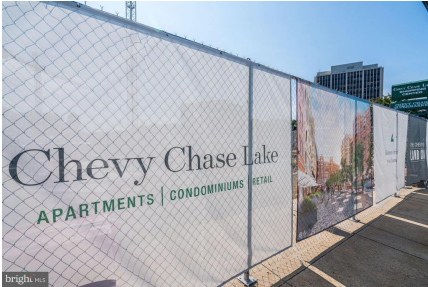
Close to the future Chevy Chase Lake shops & more!