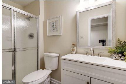
Master bedroom bath with walk-in shower & vanity