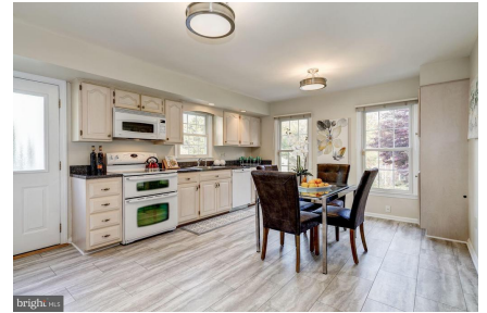
Large eat-in kitchen with wood cabinets