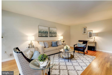
Lovely living room