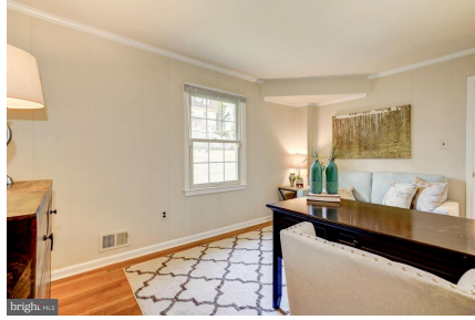
Another view of the den/office