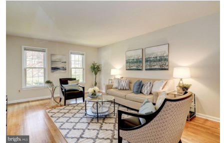
Another view of the living room