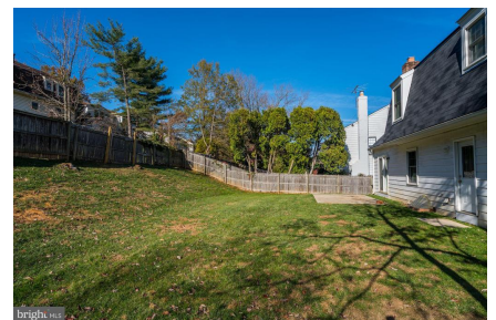
Large back yard