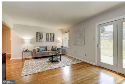
Another view of the family room w/entry to patio