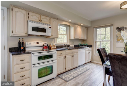
Excellent counter & storage space