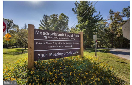
Close to the Meadowbrook Local Park