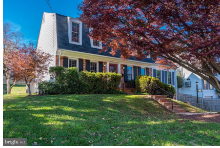
Another view of the front of the house