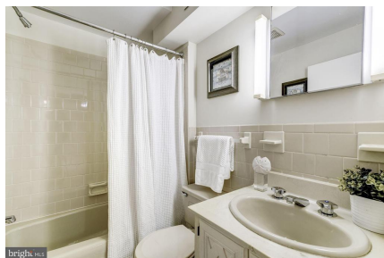
Lower level bath with tub and shower and vanity