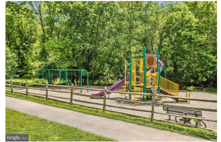
Park with large tot lot and swings