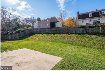
Another view of the patio and back yard