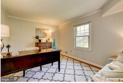
1st floor den/office