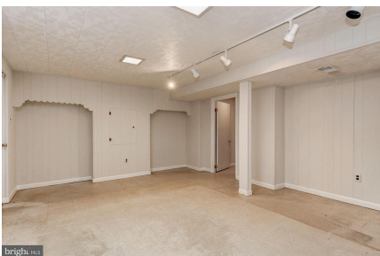
Exercise/hobby room in the lower level