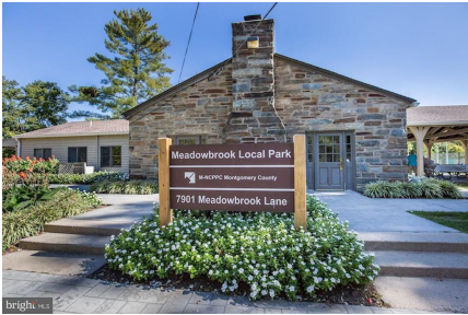
Park with building rented for neighborhood events