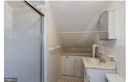
3rd Level Bath