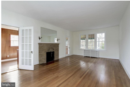
Living Room with fireplace