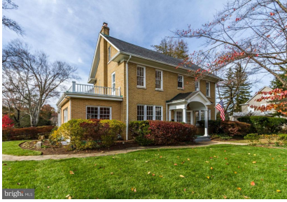
7500 Connecticut Avenue