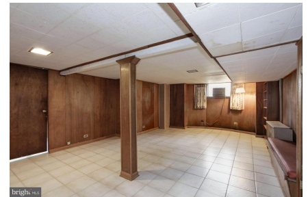
Lower level recreation room