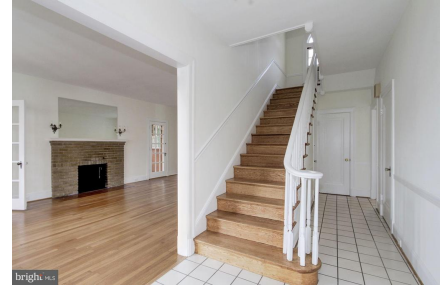
Foyer looking into living room