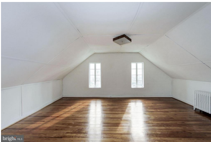
4th Bedroom (3rd Level)