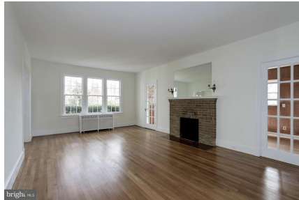
Living Room with fireplace