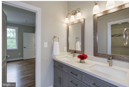
Jack and Jill Bath