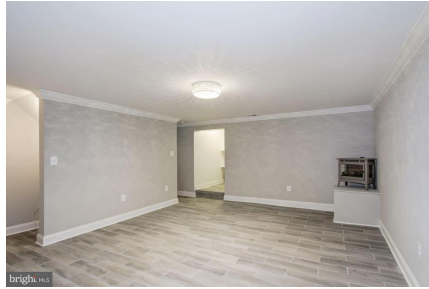
LL recreation room