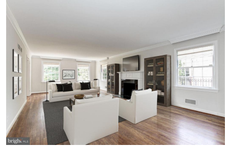
Virtually Staged living room