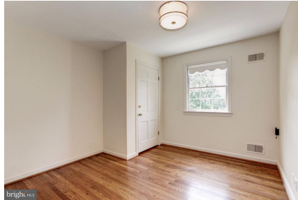
Third Floor Bedroom #6