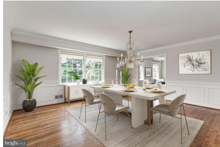
Virtually Staged dining room