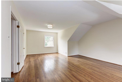
Third Floor Bedroom #5