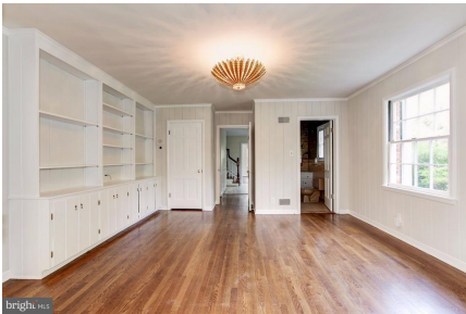
Office with en-suite bathroom