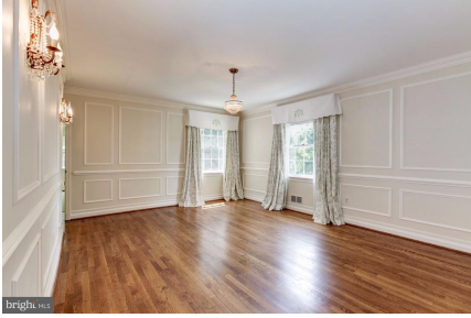
Upper Level Bedroom #3