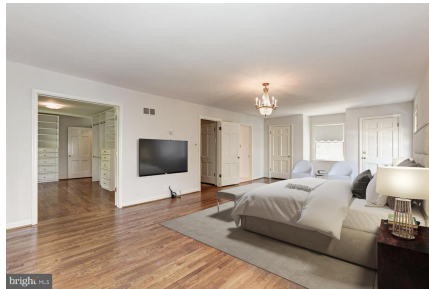
Virtually Staged masterbedroom