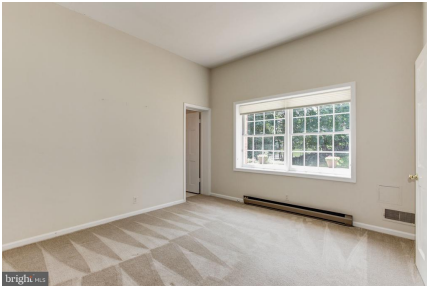
Lower Level Bedroom #7