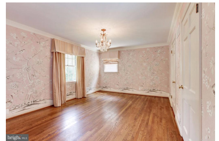
Upper Level Bedroom #2