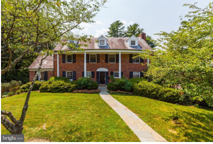
Welcome to 6204 Garnett Drive