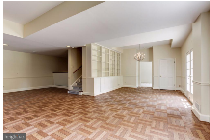
Lower Level Rec Room