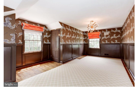
Third Floor Bedroom #4