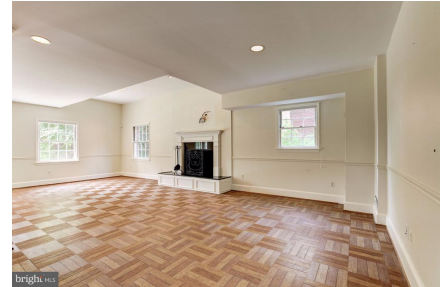
Lower Level Rec Room