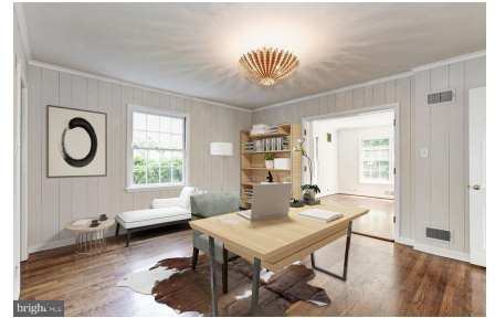
Virtually Staged study/den