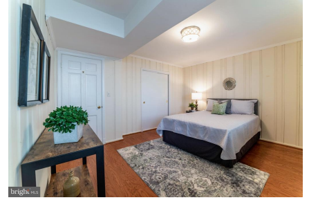
Lower level bedroom