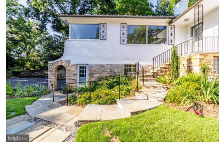
Huge driveway for privacy