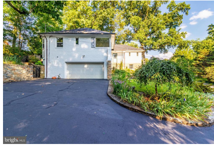
2 Car attached garage