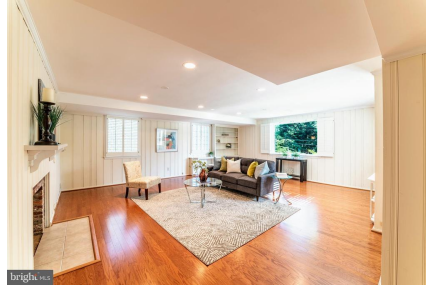
Lower level family room