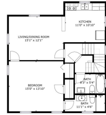
UNIT # 1