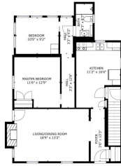
UNIT # 3