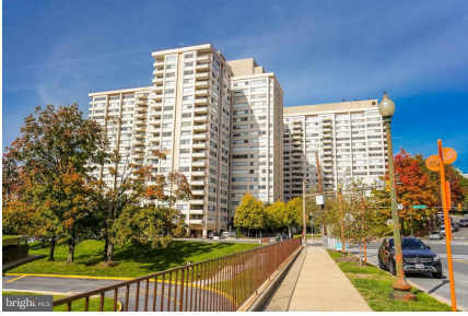
The Willoughby of Chevy Chase Condominium