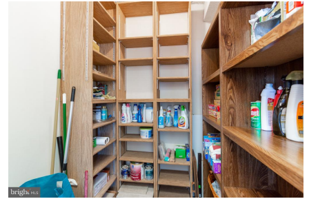
Great storage areas