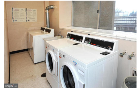
Floor Laundry Room