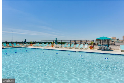
Rooftop Swimming Pool