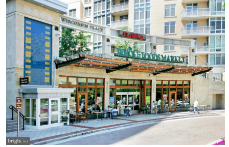
Friendship Heights WholeFood Market