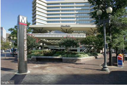
Friendship Heights Metro