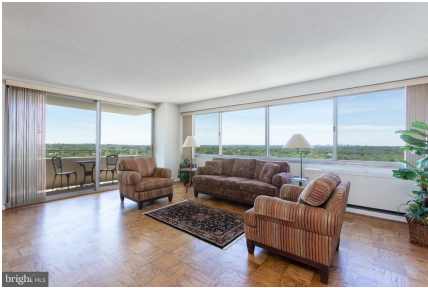
Living Room with sweeping views