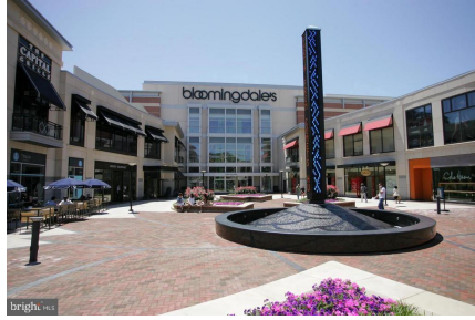
Friendship Heights Shops and Restaurants