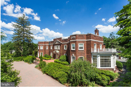
3911 Bradley Lane - Chevy Chase, MD