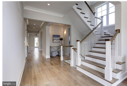
Dramatic entry foyer