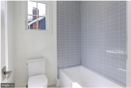
Secondary bath with high tub deck