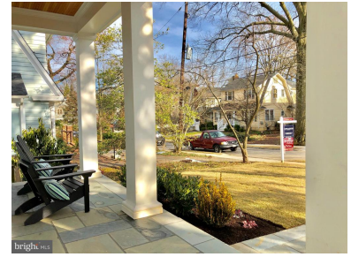
Front porch looking out