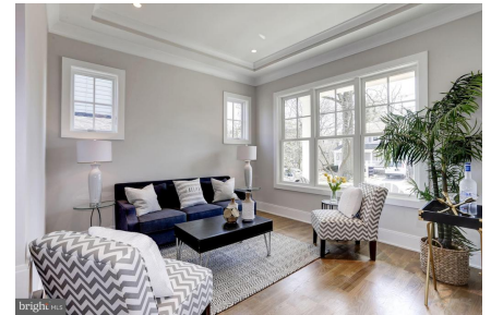
Living room with pretty street views