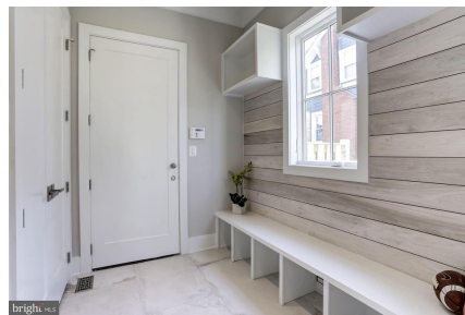
Mud room with ship lap finish, storage & bench