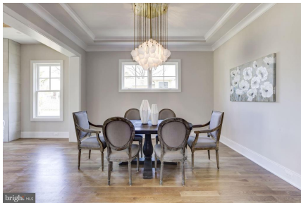
Formal dining room