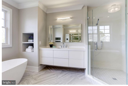
Owner's bath w/shower view