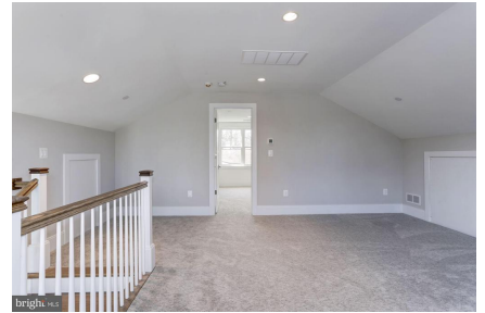
Third floor loft with adjoining bedroom & bath