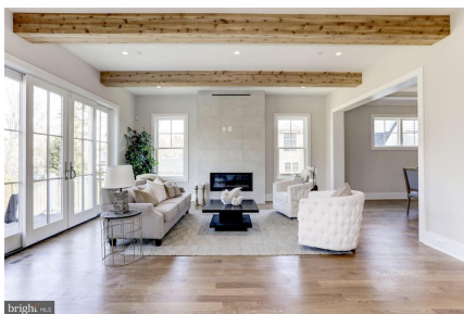
Great room w/wall of windows!