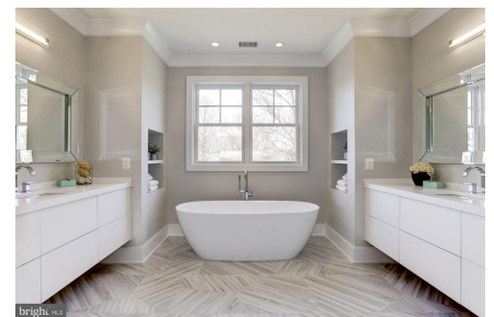
Owner's spa bath