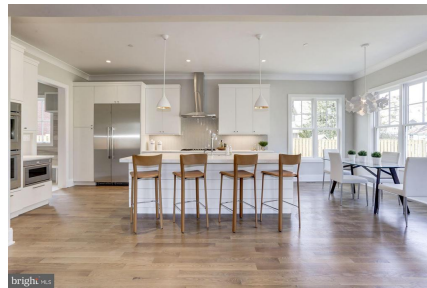
Impressive, open kitchen