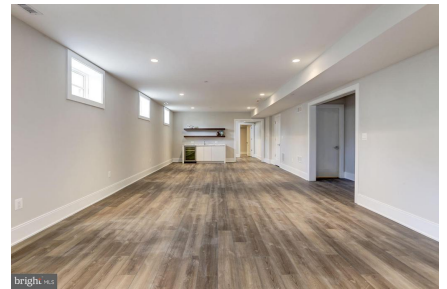
Rec Room with plentiful natural light