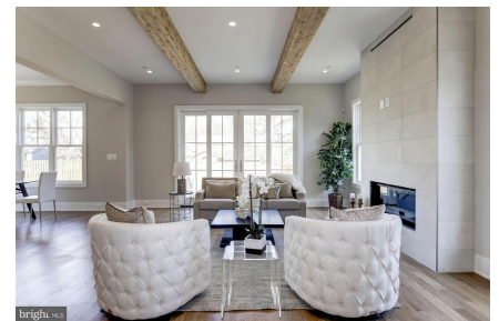
Great room with beam details & gas fireplace