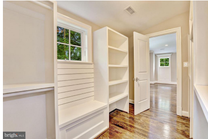
Master Walk-in His/Her Custom Closets