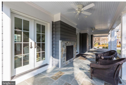
Expansive Side Porch with Dual Gas Fireplace