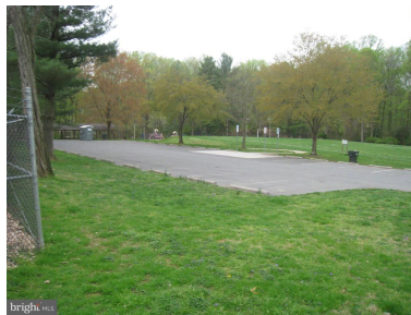
SOCCER FIELD, TENNIS COURTS, BASKETBALL COURTS