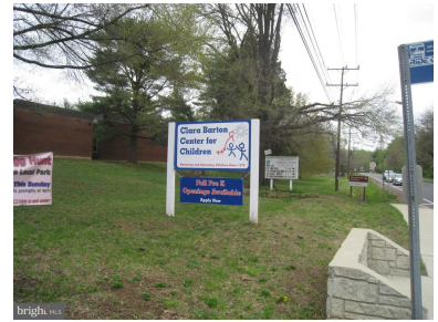
CLARA BARTON COMMUNITY CENTER