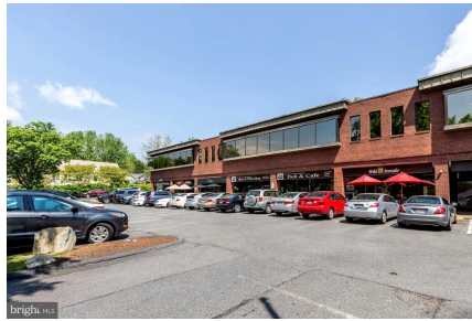
Strip Mall w/Beauty Salon, Restaurants Post Office