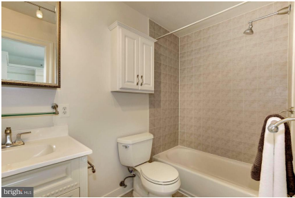
MASTER BATHROOM W/SHOWER/TUB COMBINATION