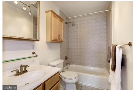
UPPER LEVEL - BATHROOM #3