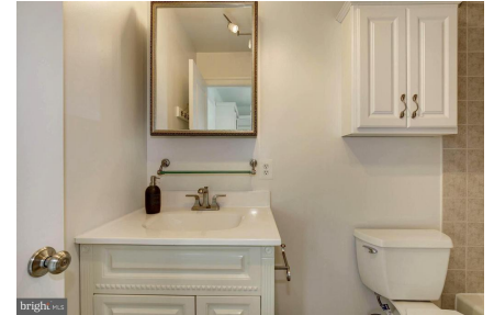
MASTER BATHROOM #2