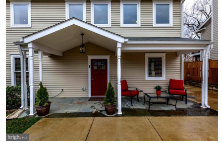
METICULOUSLY MAINTAINED 5 BR, 3 BATH HOME CONCRETE DRIVEWAY W/50 AMP SERVICE FOR AN RV THIS HOUSE HAS TONS OF LIGHT!