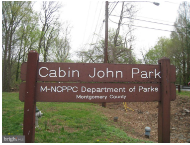
CABIN JOHN PARK