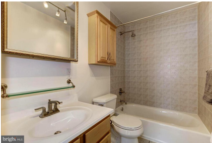
UL BATHROOM #3 W/SHOWER/TUB COMBINATION