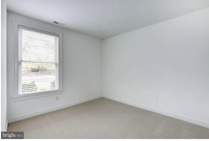
MAIN LEVEL- BEDROOM #2