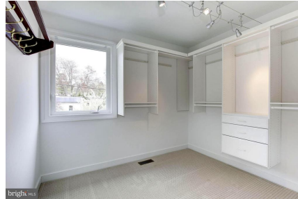
MBR HUGE CUSTOM WALK-IN CLOSET