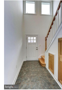
INVITING LARGE STONE-FLOORED COVERED PORCH TWO-STORY HIGH TILED FOYER EXTRA FOYER STORAGE CLOSET & CABINET