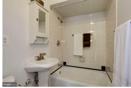
MAIN LEVEL- FULL BATHROOM #1