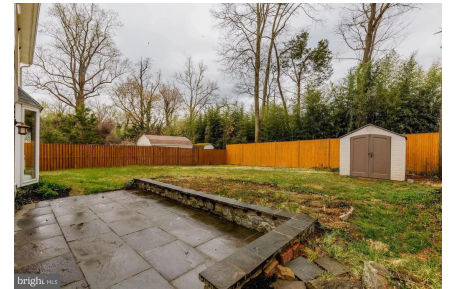
FENCED BACKYARD WITH STORAGE SHED