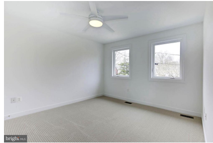
UPPER LEVEL- BEDROOM #4