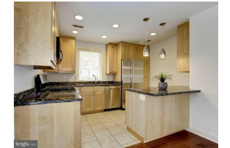
DR W/FRENCH DOORS TO PATIO & BACKYARD KITCHEN W/STAINLESS STEEL APPLIANCES