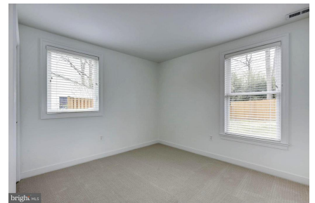
GRANITE COUNTERTOPS W/LOTS OF CABINET SPACE KITCHEN WITH BREAKFAST BAR MAIN LEVEL- BEDROOM #1