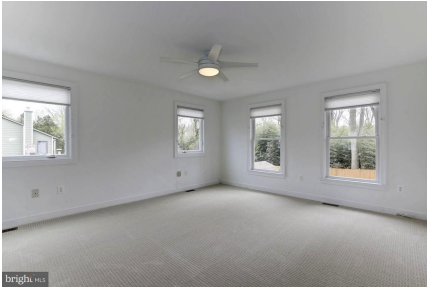
HUGE MASTER BEDROOM W/CEILING LIGHT FAN