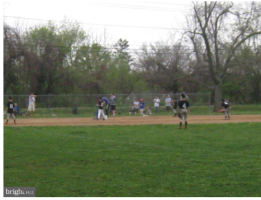
SOCCER FIELD, TENNIS COURTS, PLAYGROUND