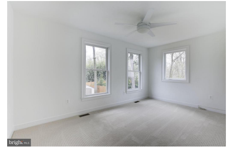
UPPER LEVEL- BEDROOM #5