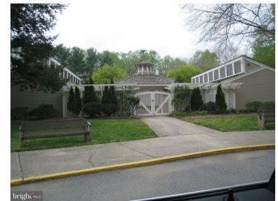
PALISADES SWIM CLUB