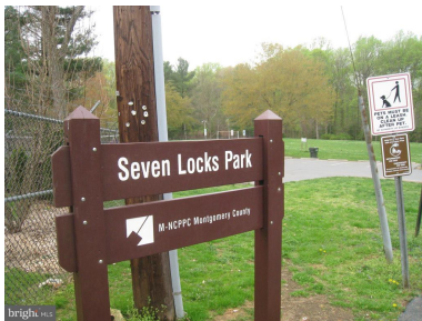
SEVEN LOCKS PARK