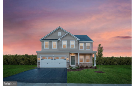
Hudson Elevation Option