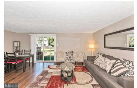
Family and Dining Room