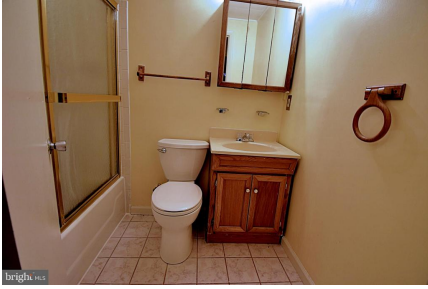
Full Bath #2