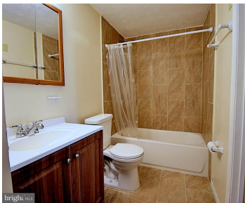
Full Bath #1