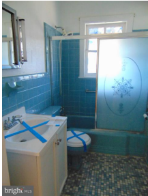
main full bath