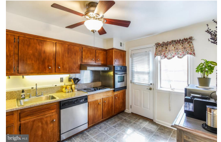
Kitchen w/Access to Side Yard