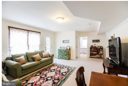
Walk-out Recreation Room