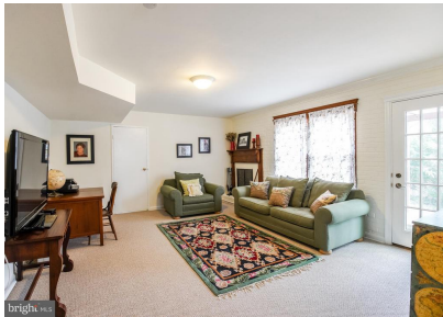
Recreation Room w/Fireplace