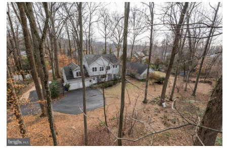
Elevated view of the site from the Northwest