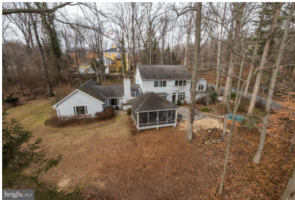
Elevated view of the site from the Southeast