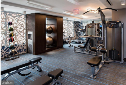
State of the art fitness center