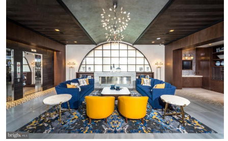
Main building lobby area