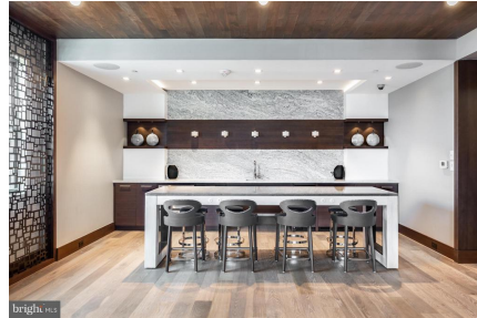
Community club room