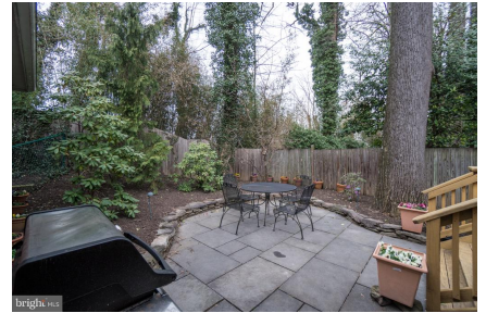
Gorgeous Contemporary in the heart of Bethesda!