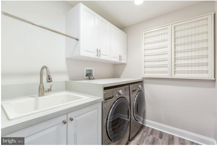
Second Floor Laundry