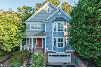
5423 York Lane