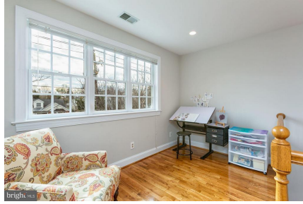
Second Floor Landing