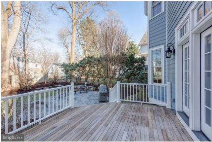
Deck overlooking Patio and Rear Yard