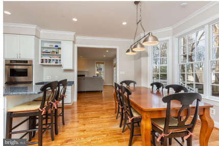
Breakfast Area open to Family Room