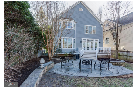
Rear Yard and Patio