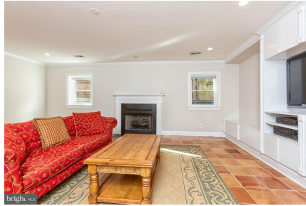
Finished Lower Level