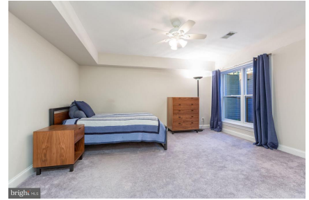
Lower Level Bedroom