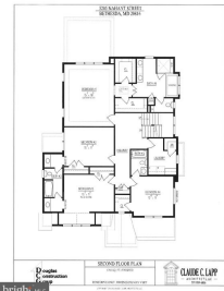
Upper Level I Floor Plan