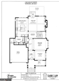
Main Level Floor Plan