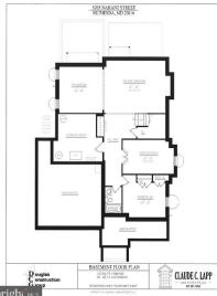
Lower Level Floor Plan