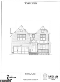
Main Front Elevation