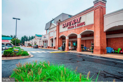
Super handy Safeway grocery store