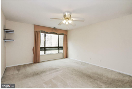
Master bedroom from walk-in closet