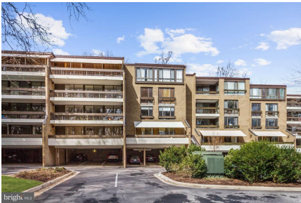
4974 Sentinel Drive