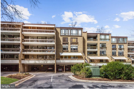
4974 Sentinel Drive