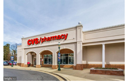
Convenient CVS pharmacy