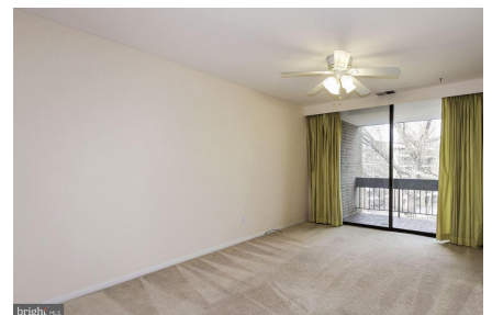
Hall bedroom with sliding doors to balcony