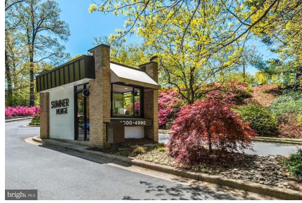
Welcome to Summer Village