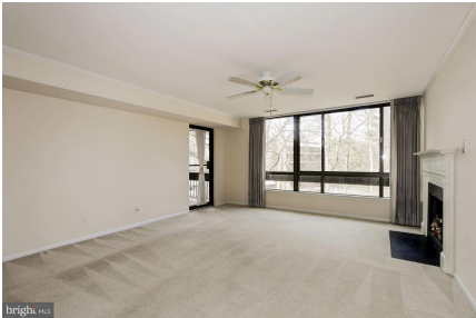
Spacious living room from foyer; door to balcony