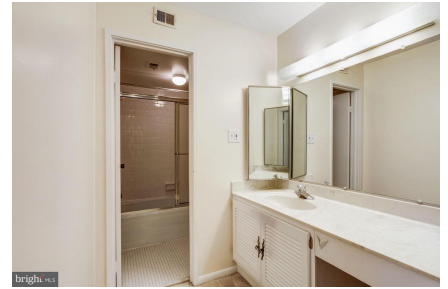
Master bath with separate vanity room; tub shower