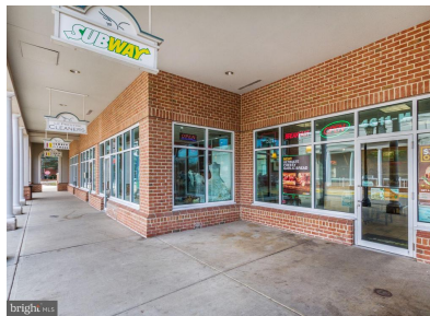
Stretch of stores in shopping center