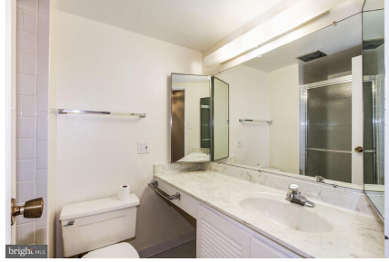
Hall bath with shower stall and sliding doors