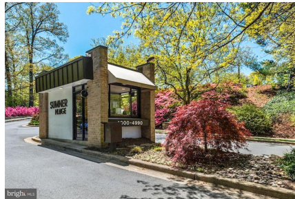
Thanks for your visit to Sumner Village