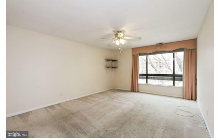
Master bedroom overlooking dogwood tree