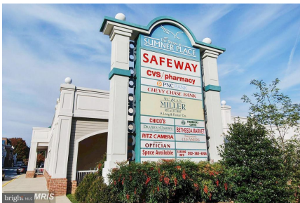
Shopping center nearby with multiple vendors