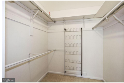
Huge walk-in master closet