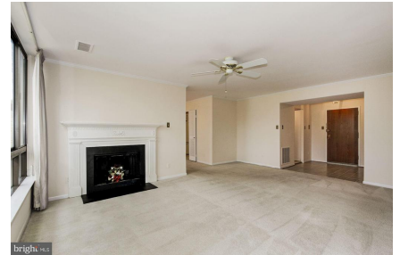
Living room toward dining room and foyer