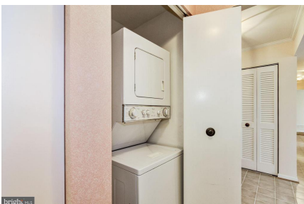
In unit, stacked washer/dryer