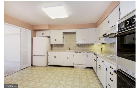
Table space kitchen from front hall