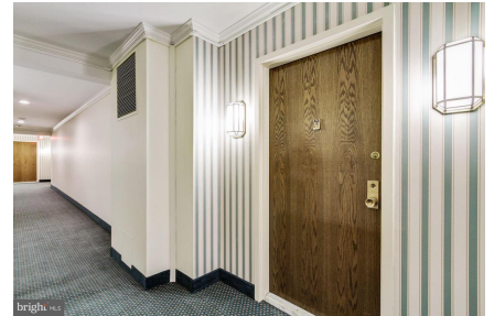
Hall and front door to apartment