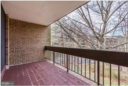
Covered balcony from living room door