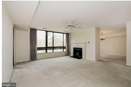
Living room toward dining room