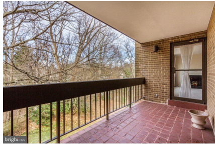
Balcony showing door to living room