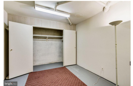
Spacious accessory storage unit included in price