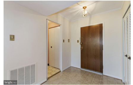
Thanks for visiting Apartment 405