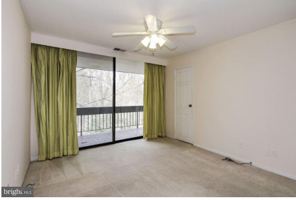
Hall bedroom toward closet overlooking oak tree