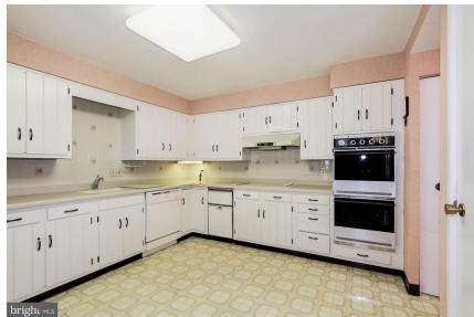
Table space kitchen with several upgrades