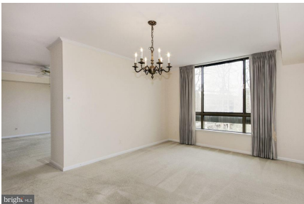
Dining room from kitchen