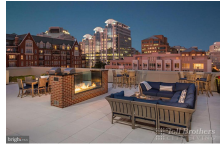
Building Rooftop Terrace and Lounge