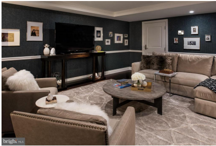
Building Amenities-Club Room