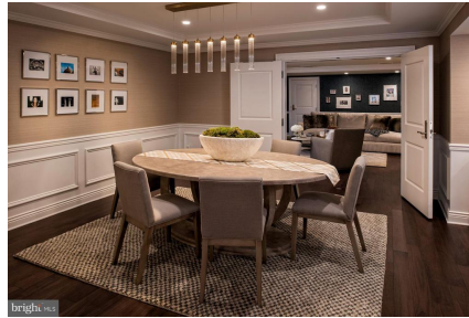
Building Amenities-Meeting Room