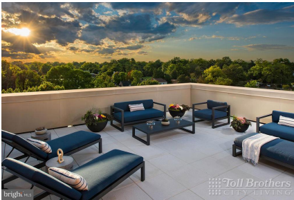
Building Rooftop Terrace and Lounge