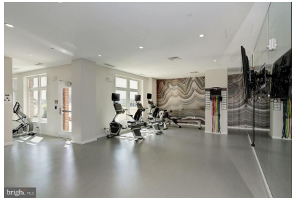
Building Amenities-Fitness Center