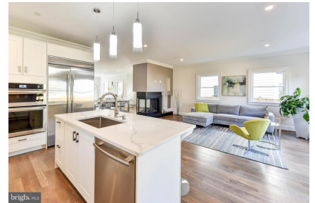
KITCHEN AND FAMILY ROOM