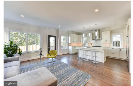
KITCHEN AND FAMILY ROOM