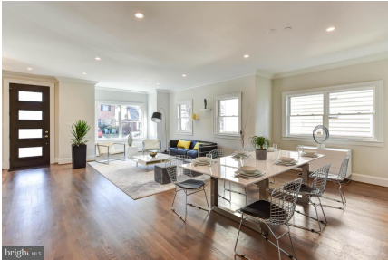
OPEN MAIN LEVEL