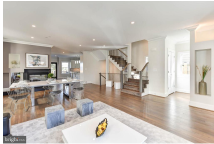
OPEN MAIN LEVEL