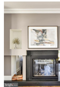
3-WAY GAS FIREPLACE