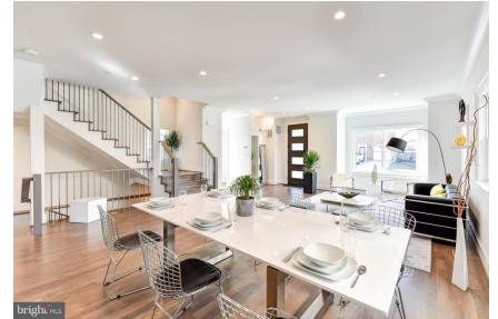
OPEN MAIN LEVEL