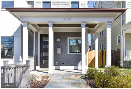
EXTERIOR FRONT ENTRANCE