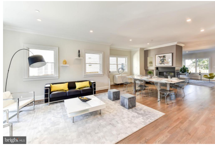
OPEN MAIN LEVEL