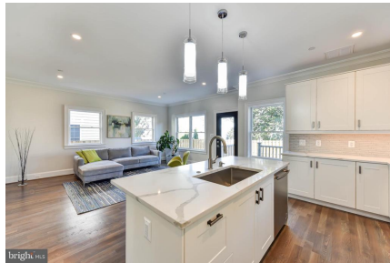
KITCHEN AND FAMILY ROOM