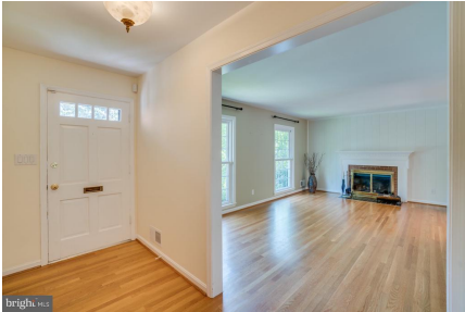
Entry Hallway leading to Living Room