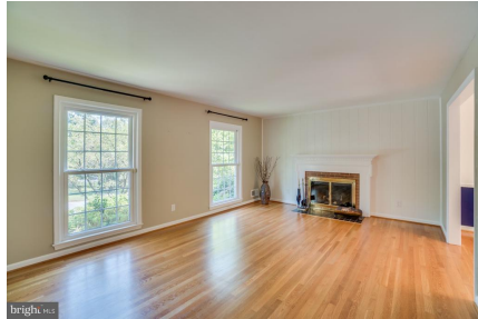
Living Room with Wood Burning Fireplace