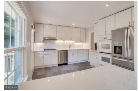
Updated Kitchen with Marble Counter and New Floors Updated Kitchen with Marble Counter and New Floors