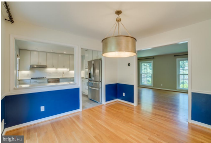
Separate Dining Room w/Patio Access