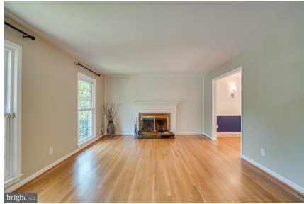
Living Room with Wood Burning Fireplace