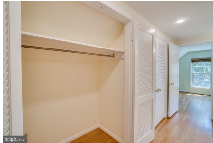
Large Master Bedroom with Sitting Room