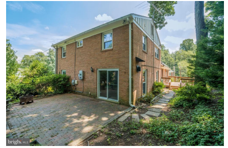
Spacious Private Backyard