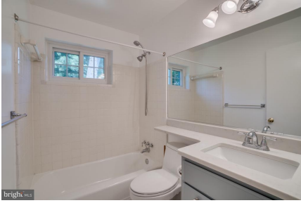
Second Full Bathroom Located on Upper Level