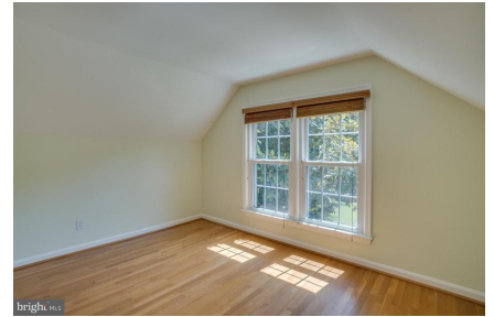
Sitting Room Located in Master Suite