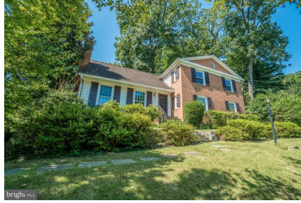
Front Entrance with Terrace yard