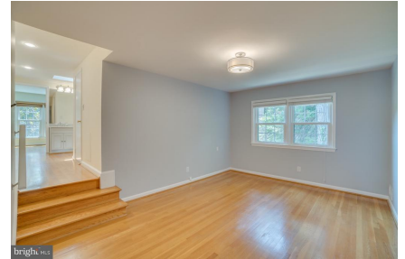
Large Master Bedroom with Sitting Room