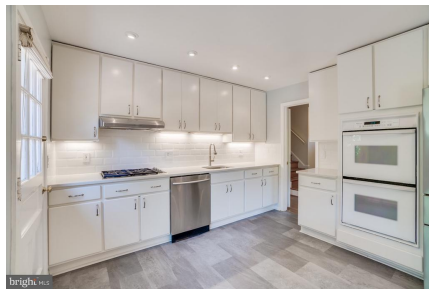
Updated Kitchen with Marble Counter and New Floors