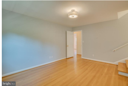
Large Master Bedroom with Sitting Room