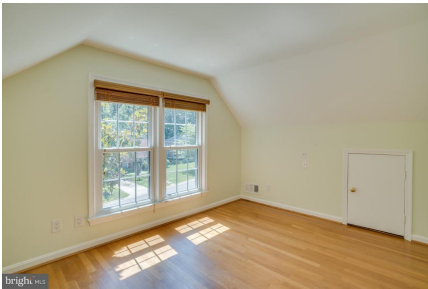
Sitting Room Located in Master Suite