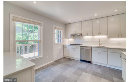
Updated Kitchen with Marble Counter and New Floors