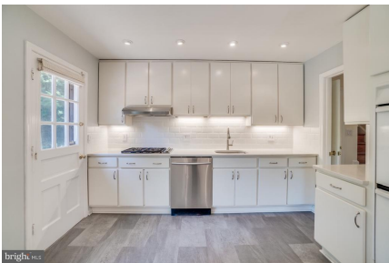
Updated Kitchen with Marble Counter and New Floors