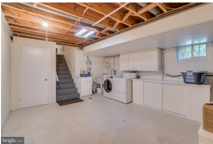
Basement Leading To Garage