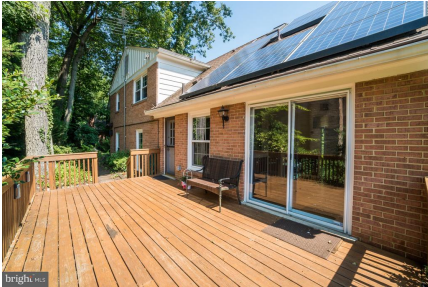
Spacious Private Backyard w/ Patio