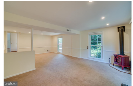
Family Room w/ Backyard and Guest Room Access Family Room w/ Backyard and Guest Room Access Family Room w/ Backyard and Guest Room Access