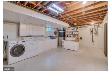
Basement Leading To Garage