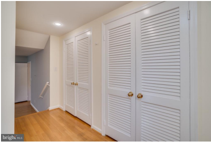
Large Master Bedroom with Sitting Room