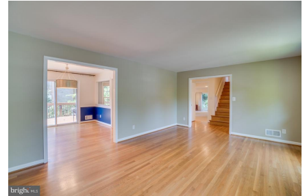
Living Room with Wood Burning Fireplace