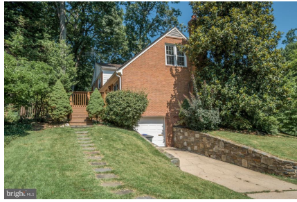
Side Loading Garage. Main entry of Choice