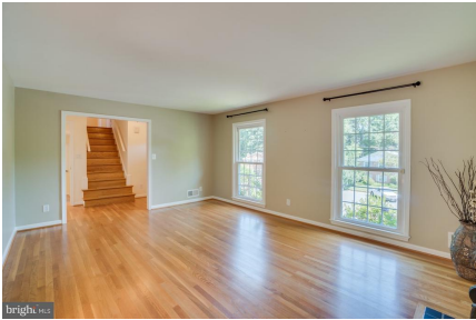
Living Room with Wood Burning Fireplace