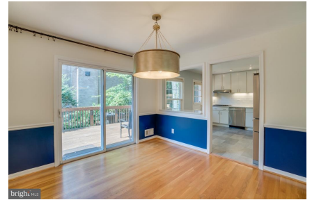
Separate Dining Room w/Patio Access