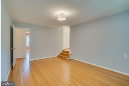
Large Master Bedroom with Sitting Room