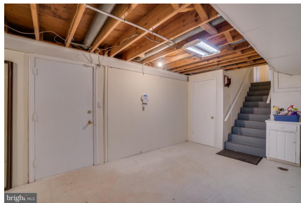
Basement Leading To Garage