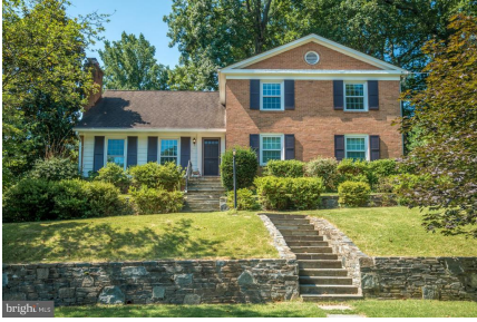
Front Entrance with Terrace yard