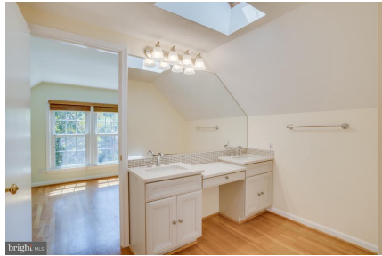
Large Master Bedroom with Sitting Room