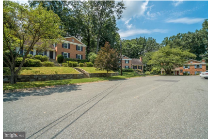
Property Located in a Cul-De-Sac