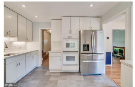
Updated Kitchen with Marble Counter and New Floors