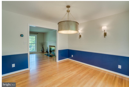
Separate Dining Room w/Patio Access