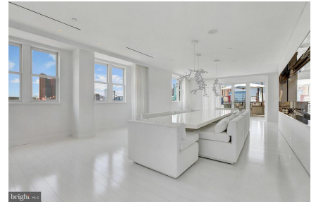
36 x 17 Dining Room with sunset views