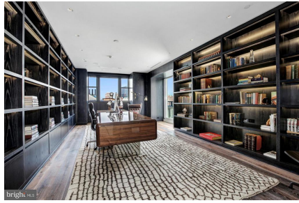
Incredible office with access to private terrace