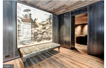
Media Library outside of Home Theater