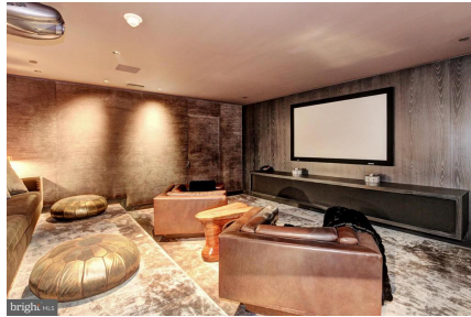
State of the Art In Home Theater