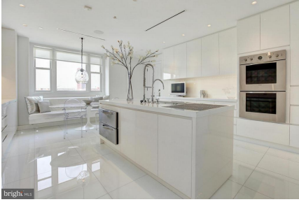
West views from the large formal Kitchen