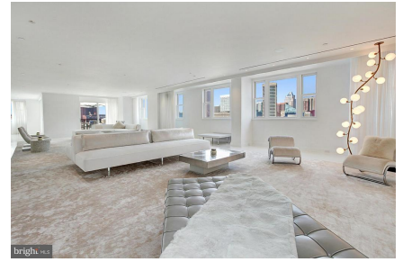
Expansive 1500 sq ft Living Room