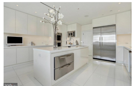
Gas cooking and expansive work spaces