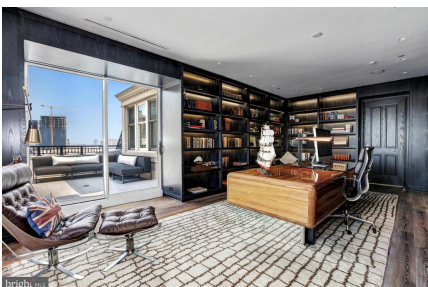
Office with views of the Inner Harbor