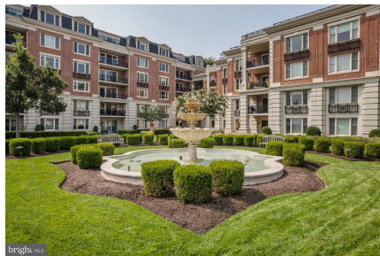
The Ritz Carlton waterfront courtyard