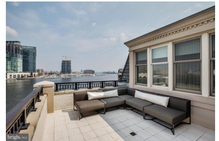
One of six private terraces