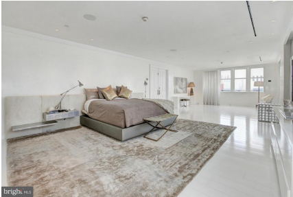
Enormous Master bedroom suite with private terrace