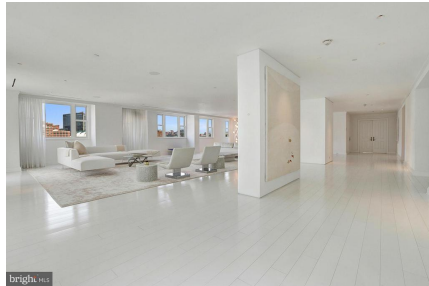
Gallery style walls between Foyer and Living Rm