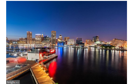
One of several Inner Harbor views