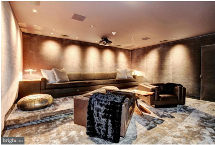
State of the Art In Home Theater