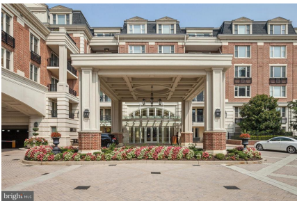
The Ritz Carlton Residences main entrance