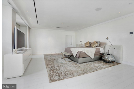
Over 700 sq ft Master Bedroom