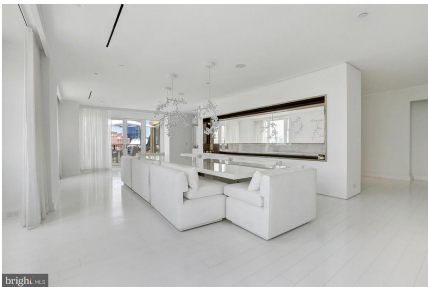
Easily accommodate seating for 16 or more