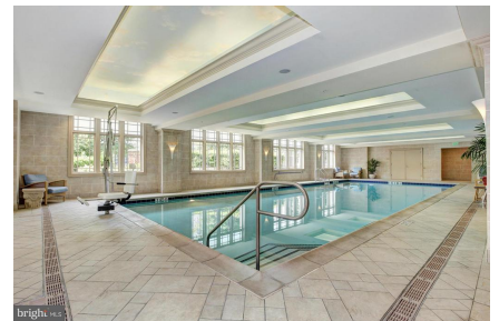
Ritz Carlton residences indoor pool