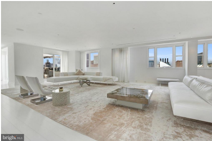
Captivating views from this incredible space