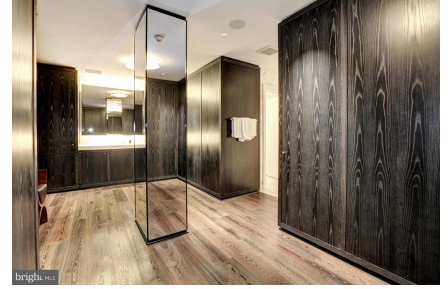
Large Master dressing room