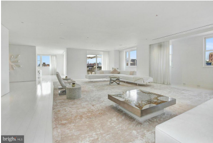
Living Room with Private Terrace access