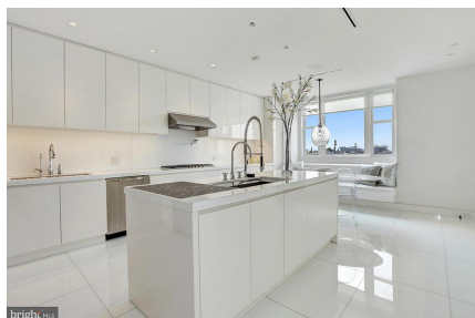
Chef's kitchen with Viking appliances