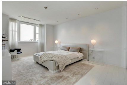
Large bedroom with Inner Harbor views