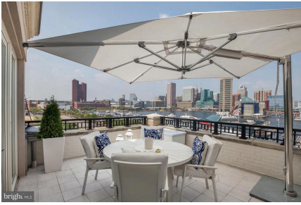
One of six waterfront terraces