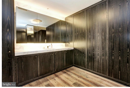
One of two private dressing rooms