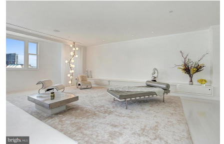
The perfect entertainment space