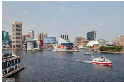
Panoramic views of the Inner Harbor and skyline