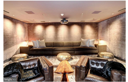
State of the Art In Home Theater