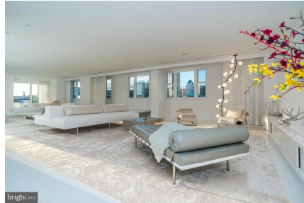
Modern flair and classic design