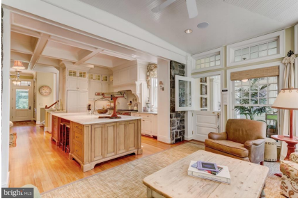
Kitchen Gathering Area