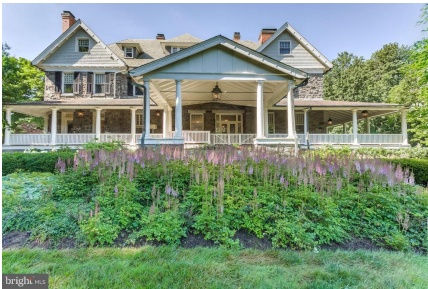
Front with Porte-Cochere