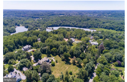
Aerial with Lake Roland