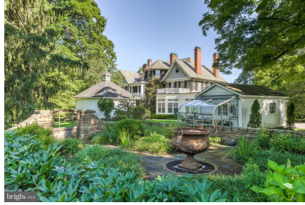
Walled Herb Garden