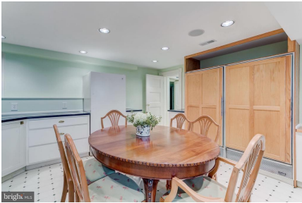
Lower Level Kitchen