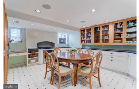
Lower Level Catering Kitchen