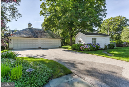
4-Car Garage & Garden Shed