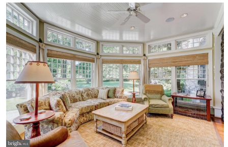
Kitchen Gathering Area