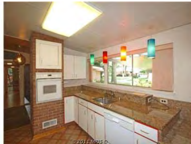
Kitchen Part 1