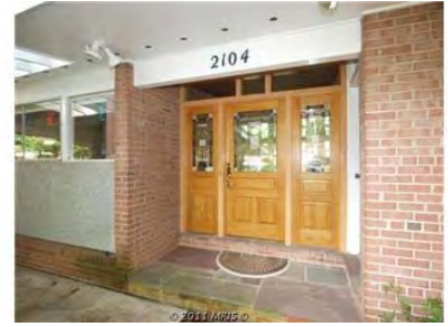
Covered Entry Porch