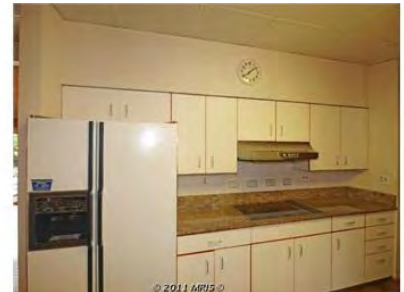
Kitchen Part 2