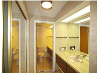
Bath (Master) 2