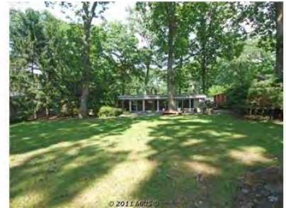
Exterior (Rear) Long View