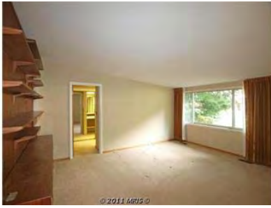
Bedroom (Master) 2