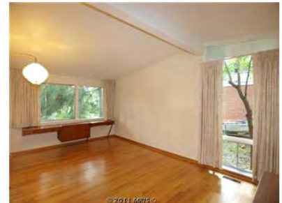
Original Bedroom (Master)