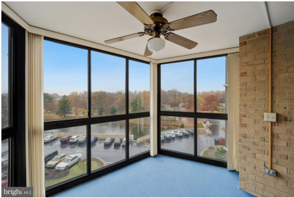
Glass enclosed Sun Room