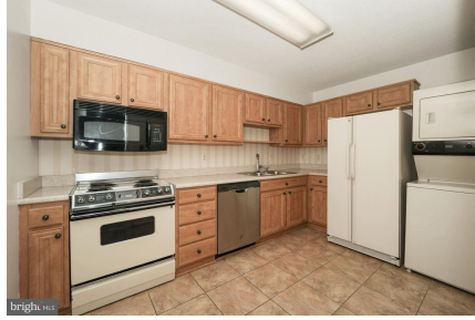
Kitchen with Washer Dryer